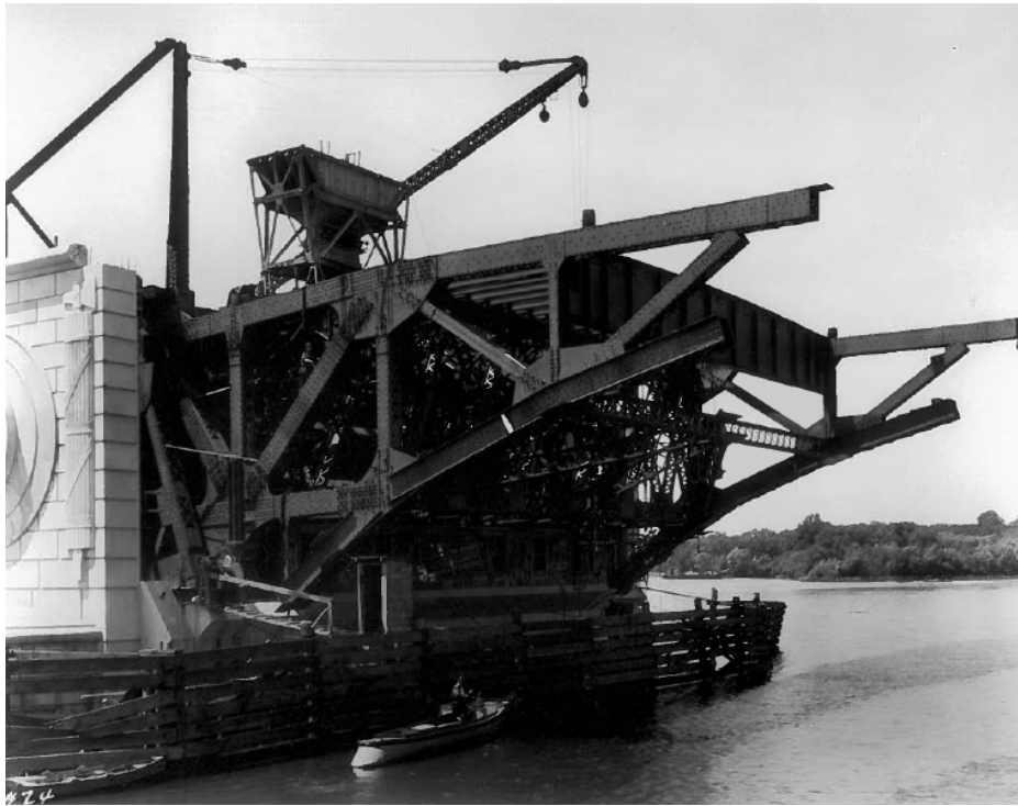
Figure 4. Each leaf of the bascule span was assembled with rivets from components fabricated at Phoenix Bridge's shop. The east leaf was erected first, and then raised to provide clearance for ships while the west leaf was being built. (NARA RG 42-AMB-1-30)