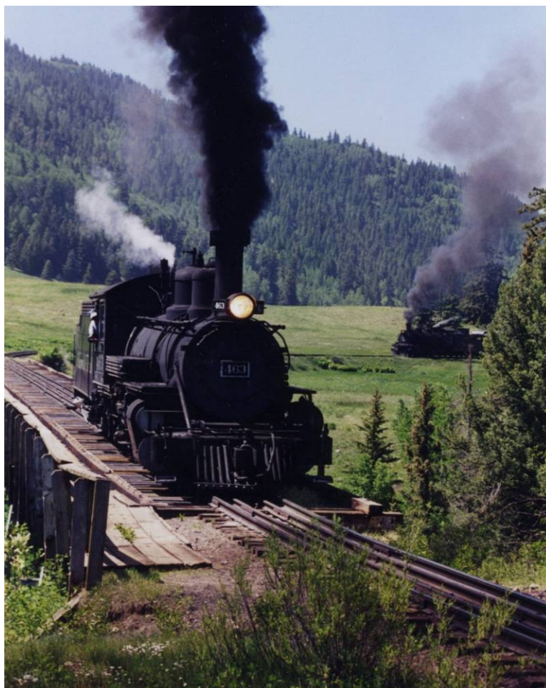
Frame 8. Cumbres & Toltec Scenic Railroad. K-27 engine 463 crosses Wolf Creek trestle in advance of second locomotive and train on eastbound run from Chama to Antonito. Photographer unknown. Date unknown.