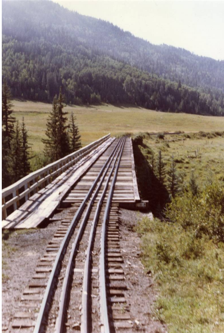
Frame 18. View from east end of bridge (looking south toward Chama).