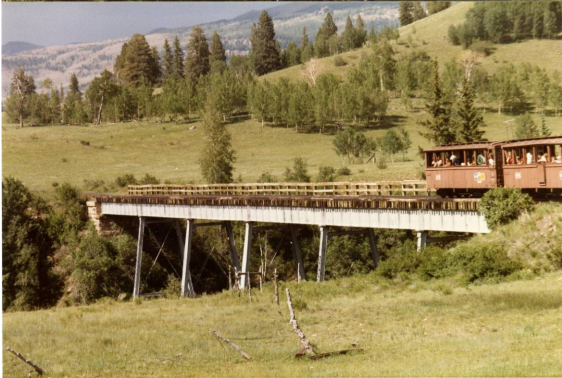
Frame 16. Cumbres abutment and bents A, B, C, and D (looking north).