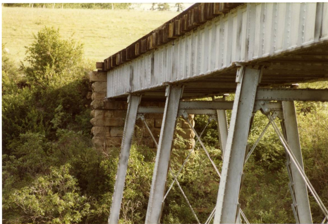
Frame 13. East end abutment and bents A, B, and C (looking north).