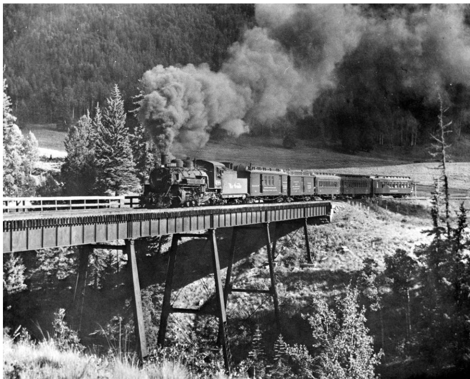
Frame 3. Eastbound San Juan passenger train crossing the Wolf Creek bridge, locomotive K-36 Class #488. Date ca. 1938.