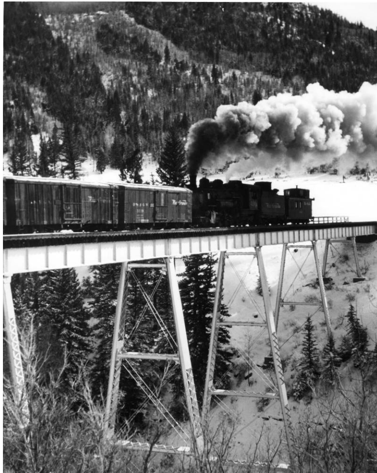
Frame 1. K-37 Class locomotive #490 acts as helper on a freight train climbing Cumbres Pass in winter. Date unknown.