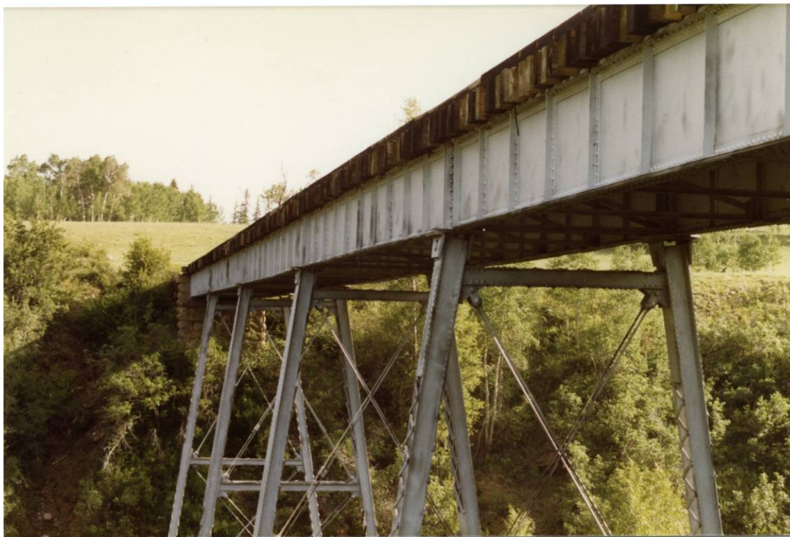
Frame 14. East end abutment and bents A, B, C, and D (looking north).