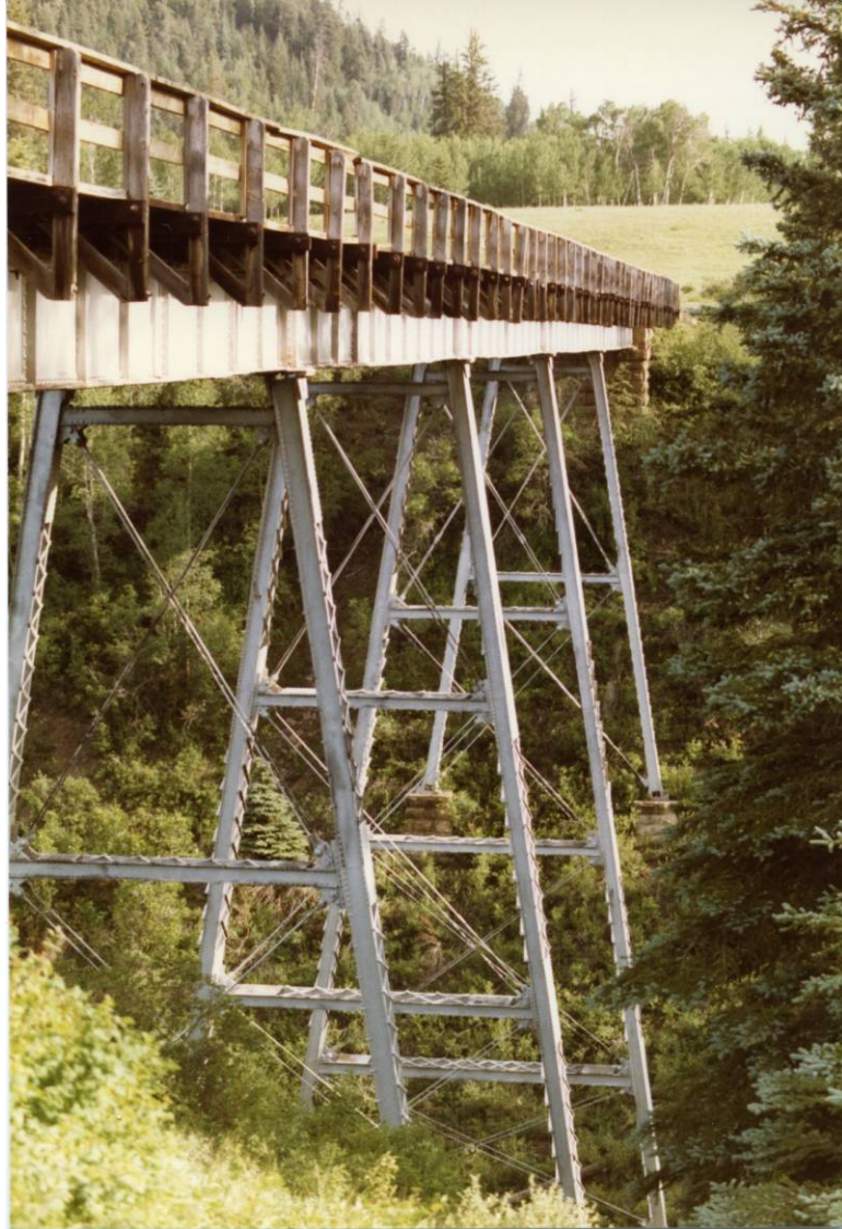
Frame 19. View from west end and upstream side of Wolf Creek (looking north).