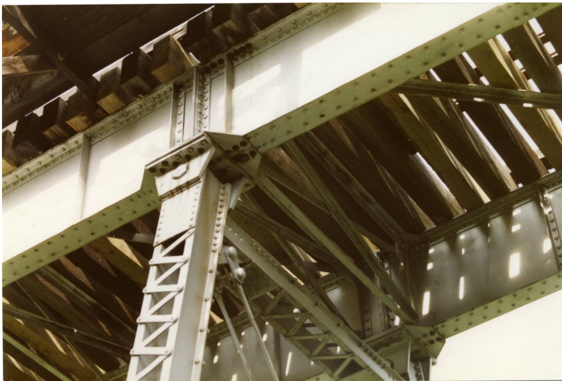
Frame 22. View of bent E upper tier from upstream side of Wolf Creek.