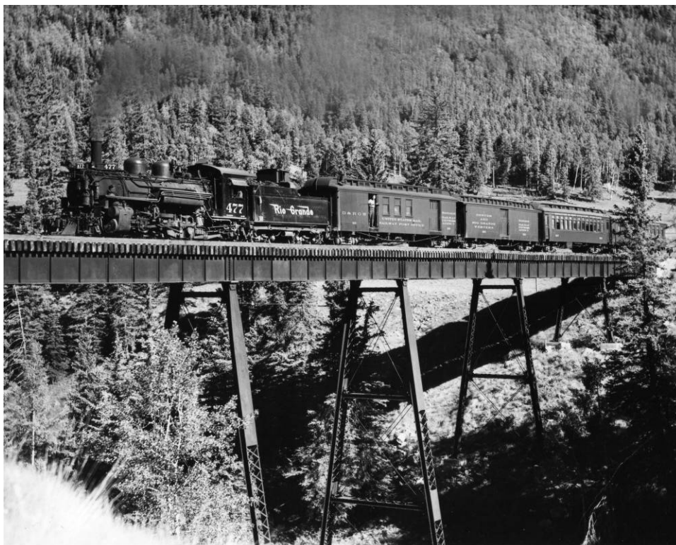
Frame 4. Westbound Train No. 115, the San Juan passenger, on Wolf Creek trestle, K-28 Class locomotive #477. Date July 2, 1941.