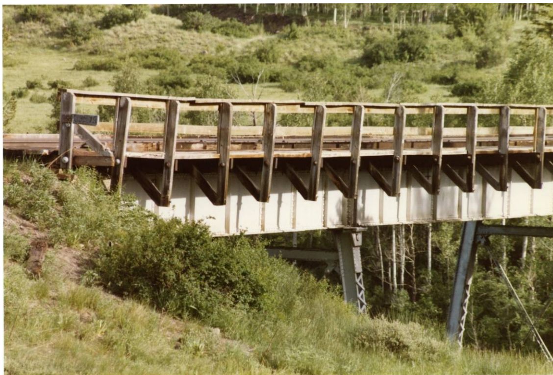
Frame 21. View of west end of bridge (looking northwest).