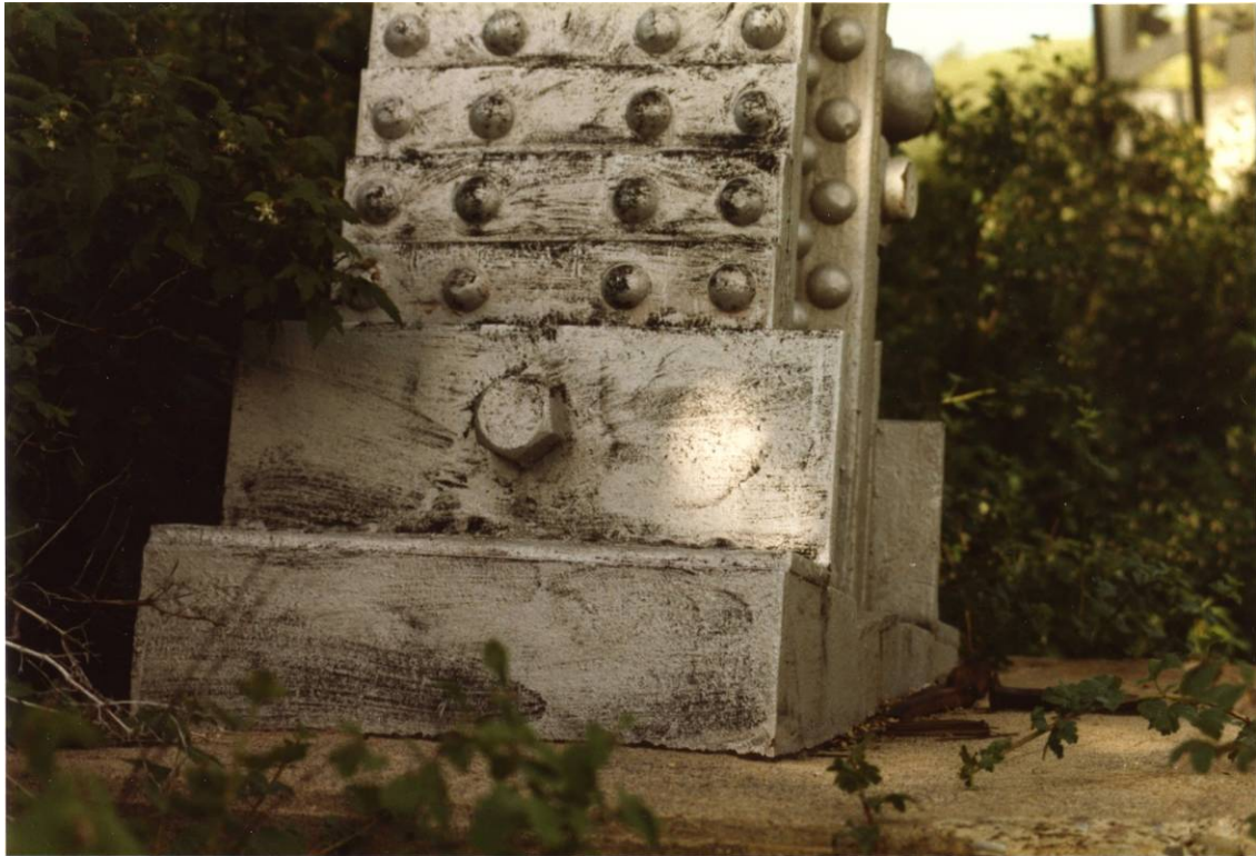
Frame 28. View of bent lower pin base detail.