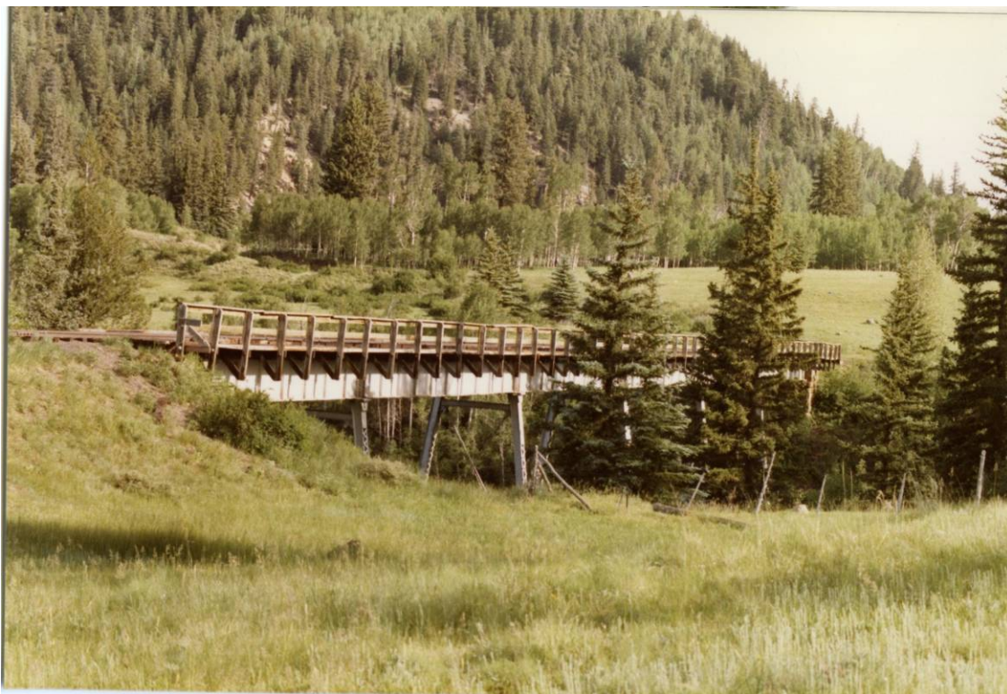
Frame 15. View from west end of bridge of upstream side of Wolf Creek (looking north).