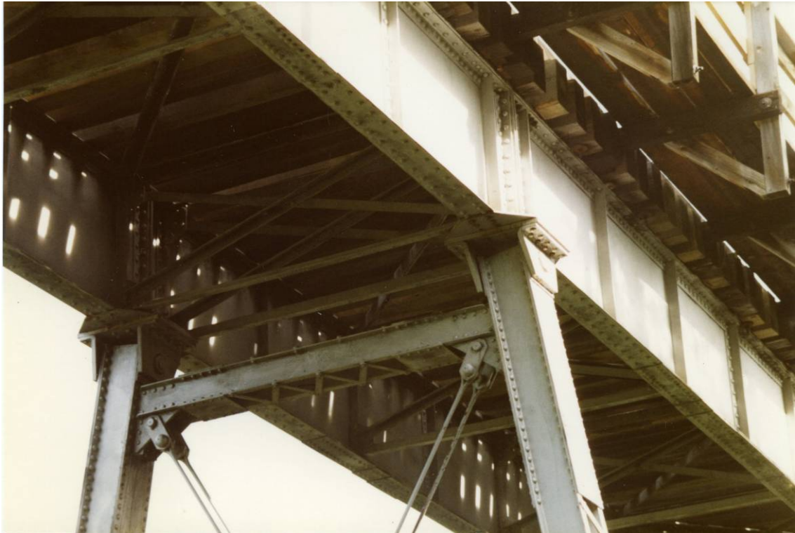
Frame 24. View of bent D upper tier from upstream side of Wolf Creek.