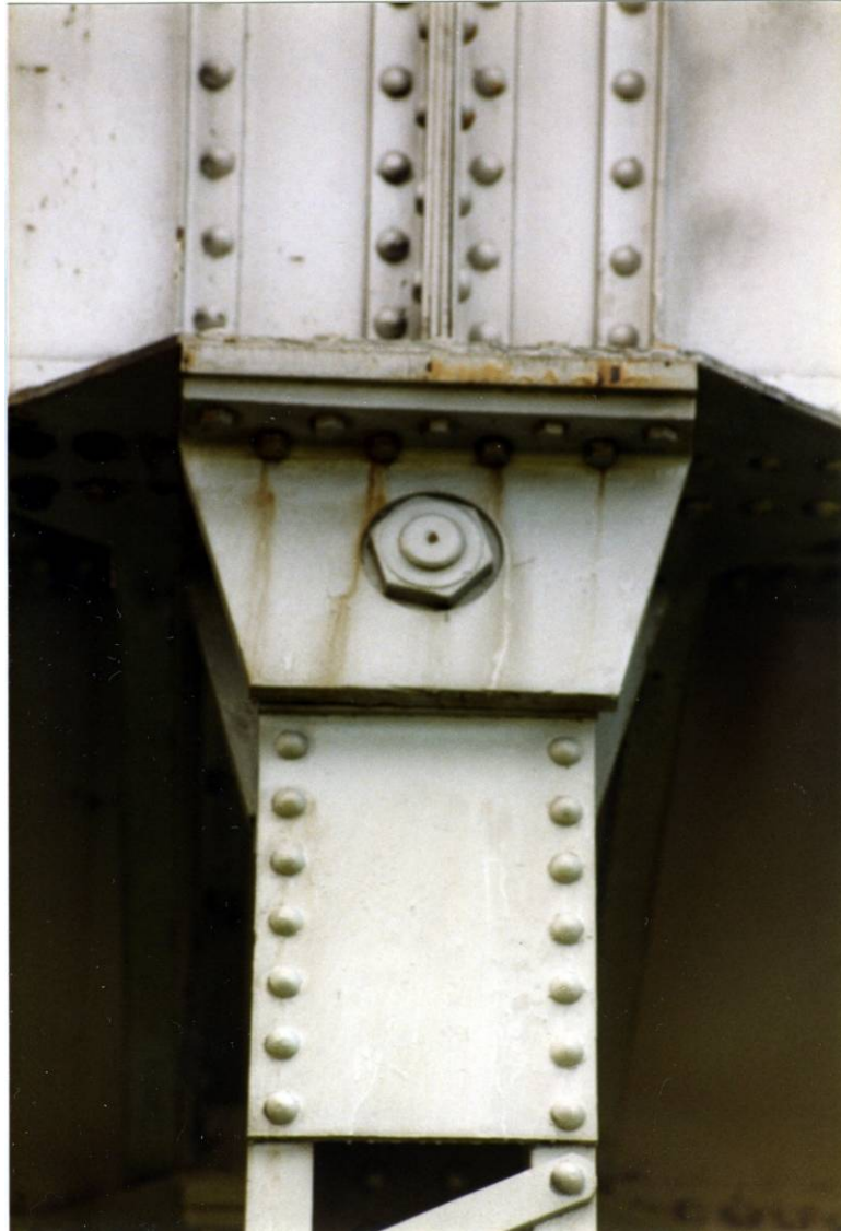
Frame 27. View of upper pin of bent E upper tier from upstream side of Wolf Creek.