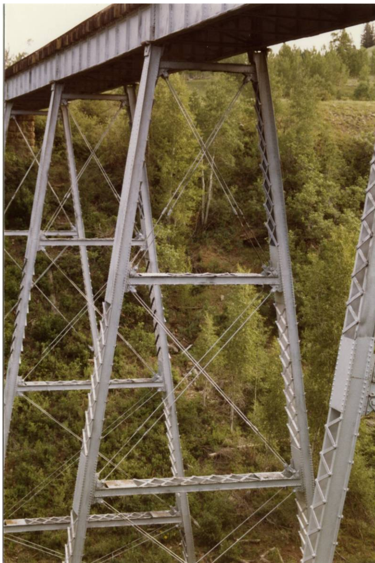
Frame 11. Cumbres abutment and bents A, B, C, and D (looking north).