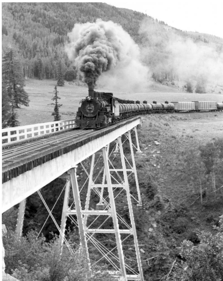
Frame 5. K-37 Class 493 brings an eastbound freight across Wolf Creek. Among the loads on the train are cars of crude oil from the Gramps oil field north of Chama. The oil was destined for the small refinery at Alamosa. Date July 18, 1952.