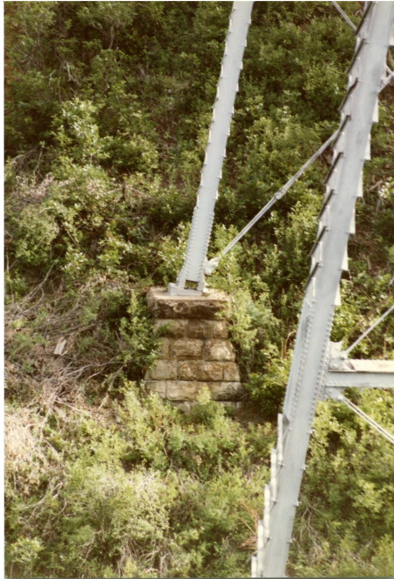
Frame 26. View of bent A lower tier from downstream side of Wolf Creek.