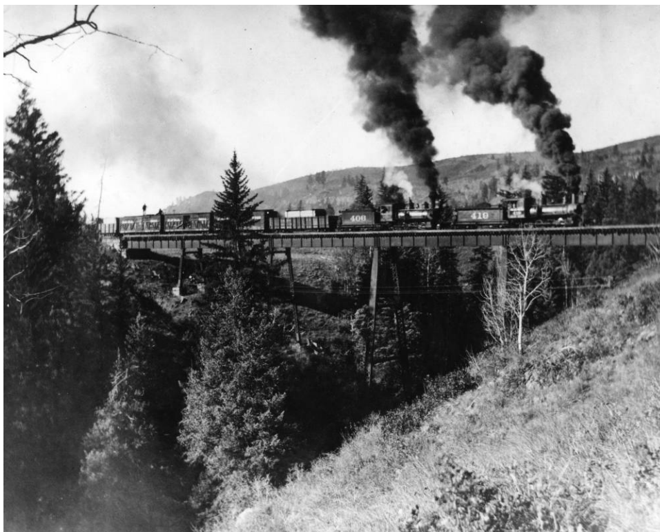
Frame 10. Class 70 engines 419 and 406 head a freight train on the Wolf Creek trestle. Date ca. 1908. (This photo has been published in many places and issued as a post card.)