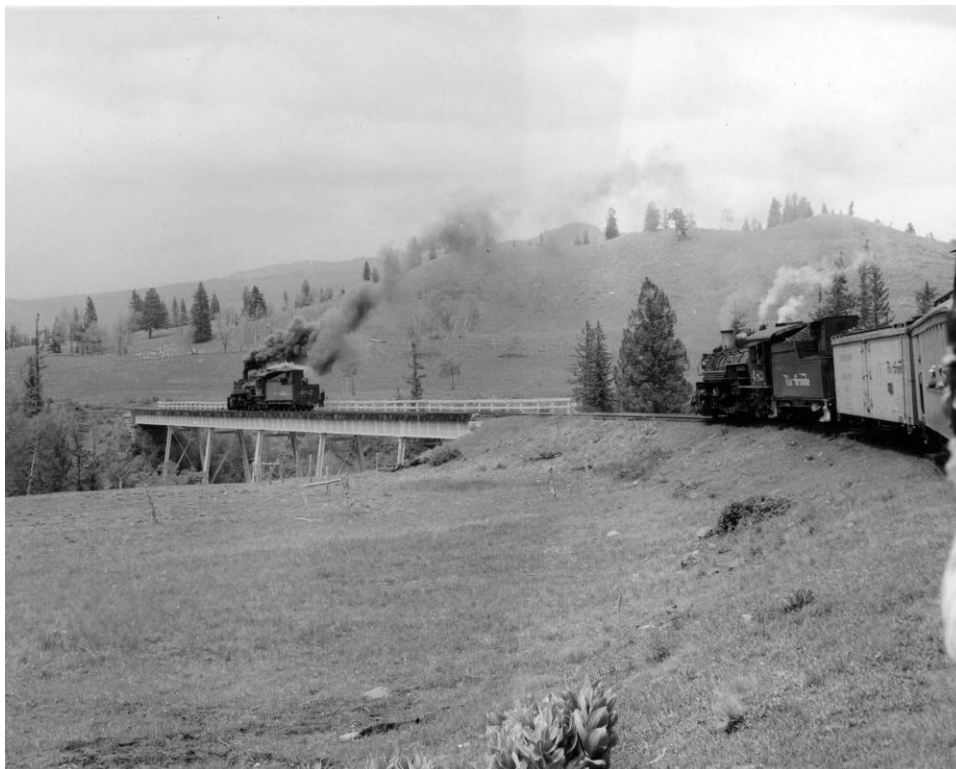
Frame 6. K-36 Class engine #487 crosses Wolf Creek trestle ahead of engine #483 with passenger train eastbound. This view illustrates the practice of separating double-headed locomotives prior to crossing the trestle. Date June 1958.