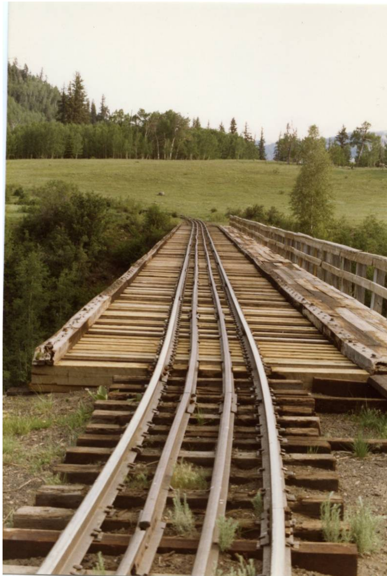
Frame 17. View from west end of bridge (looking north towards Cumbres).