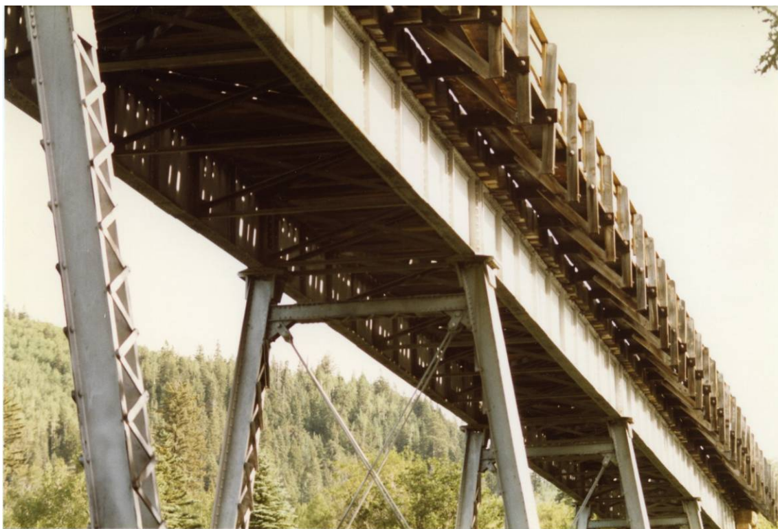
Frame 23. View of bents A, B, C, and D upper tier from upstream side of Wolf Creek.