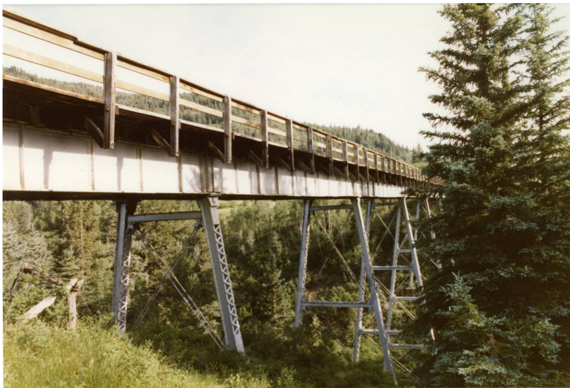
Frame 20. View from west end and downstream side of Wolf Creek (looking north).