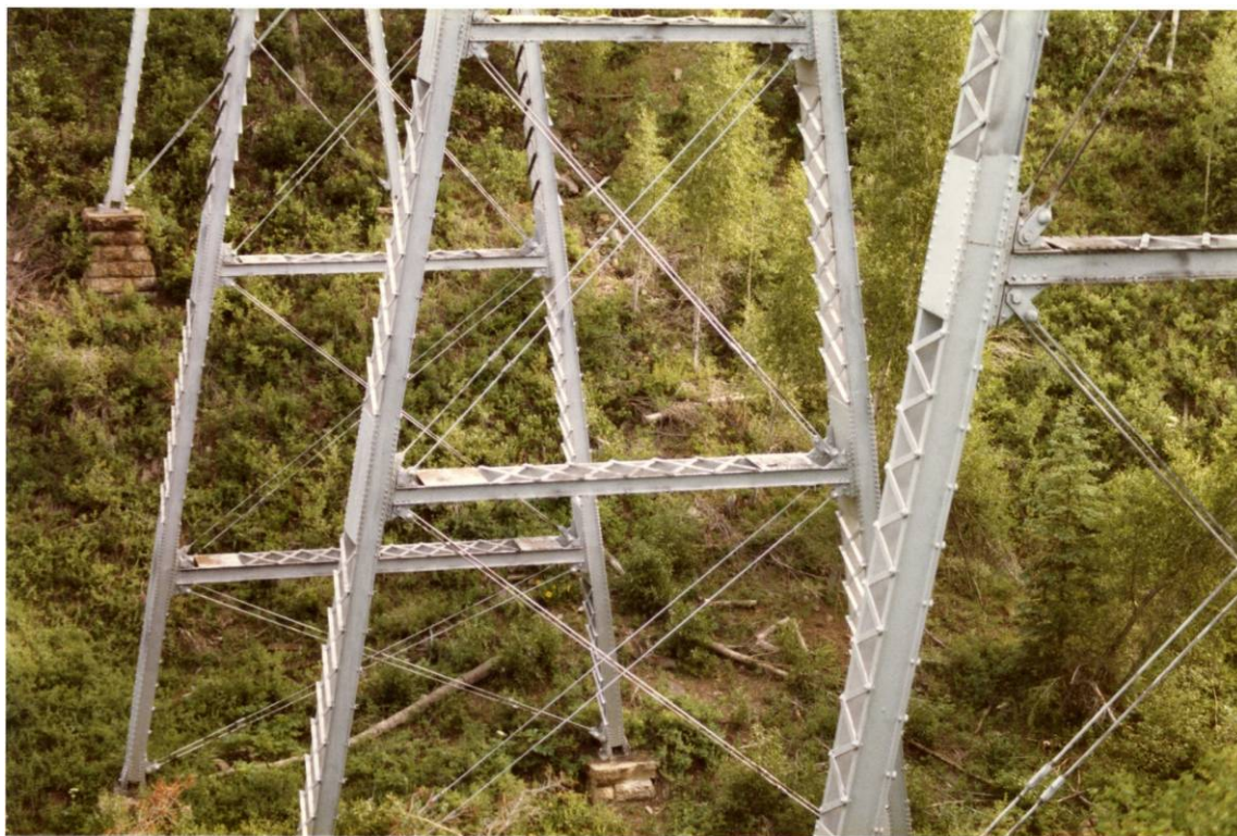
Frame 12. Base of bents A, B, C, and D (looking north).