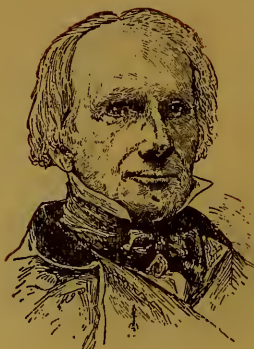
HENRY CLAY 1777-1852