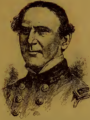
DAVID GLASGOW FARRAGUT 1801-1872