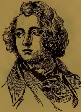
CHARLES DICKENS 1812-1870