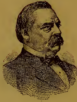
GROVER CLEVELAND 1837-1908