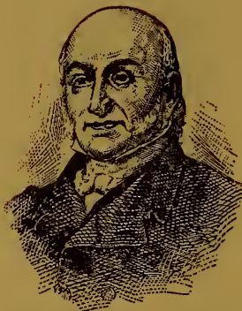
JOHN QUINCY ADAMS 1767-1848