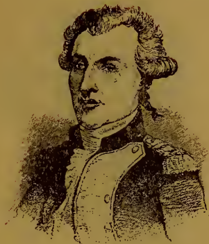
MARQUIS DE LAFAYETTE