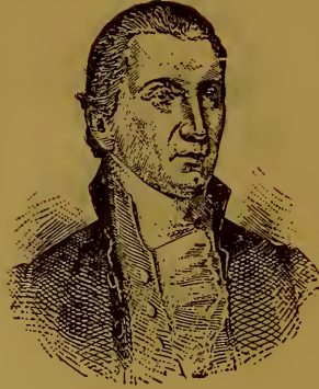
JAMES MONROE 1758-1831