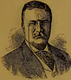
THEODORE ROOSEVELT 1858-1919