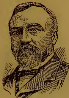
ANDREW CARNEGIE 1837-1919