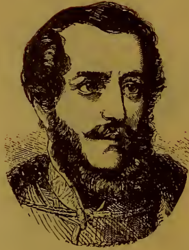
LOUIS KOSSUTH 1802-1894