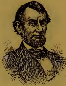
ABRAHAM LINCOLN 1809-1865