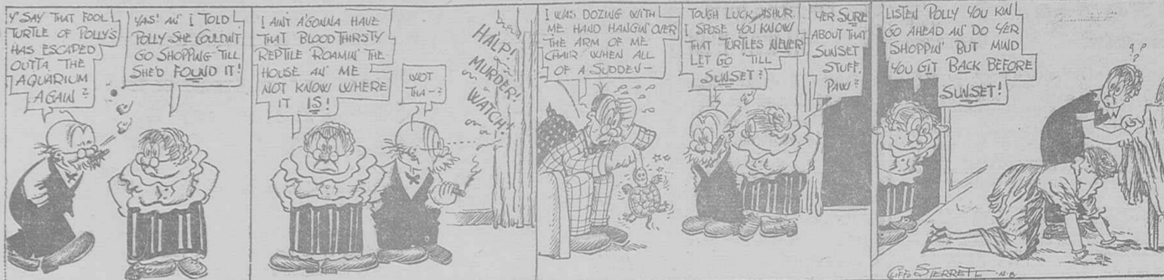
Copyright, 1916, by Newspaper Feature Service, Inc. Great Britain rights reserved. Registered in U. S. Patent Office.