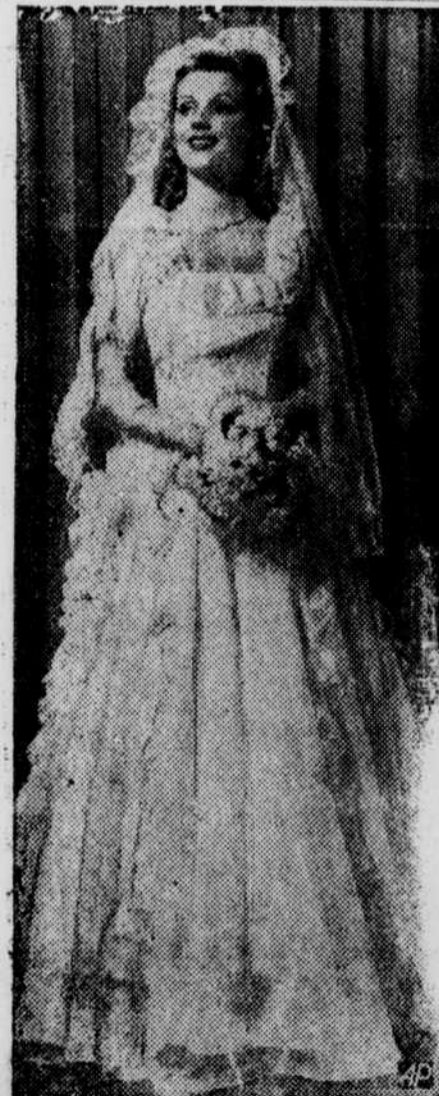
BRIDE —Dolores Moran of the films models a white organdy bridal gown made with long, fitted bodice and a full train. White eyelet embroidery is used as ruffle trim.

Before the war, Bulgaria supplied 15 per cent of Germany's chromium imports.