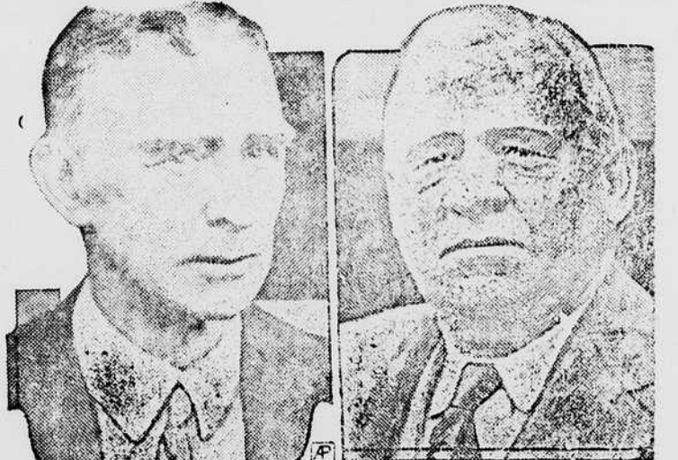
Two of baseball's greatest managers of all times are ready for the 1929 season. Connie Mack has managed the A's since 1901. John McGraw has handled the Giants since 1903.