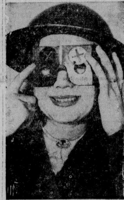
Here is an air raid precaution device which wards off flying shrapnel. Stylish in England, it is made of metal with rubber padding between the mask and face. During a bombardment the circular pieces are lowered and the wearer sees through the slits.