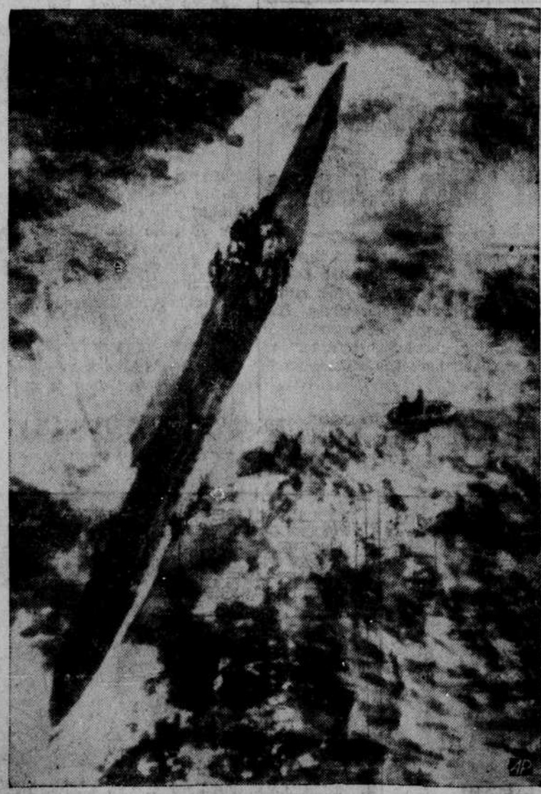
A Carley float (right) with British naval officers aboard approaches the side of what a British caption describes as a German U-boat. The U-boat, British sources said, was damaged by a Hudson bomber and forced to the surface in a heavy sea. This photo was made from a Catalina flying boat which guarded the craft until the arrival of British surface units which towed the submarine into a British port.

Full information as to the requirements for these examinations, and application forms, may be obtained at 311 Federal Building.