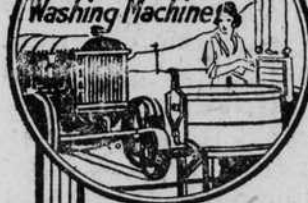
Runs Washing Machines