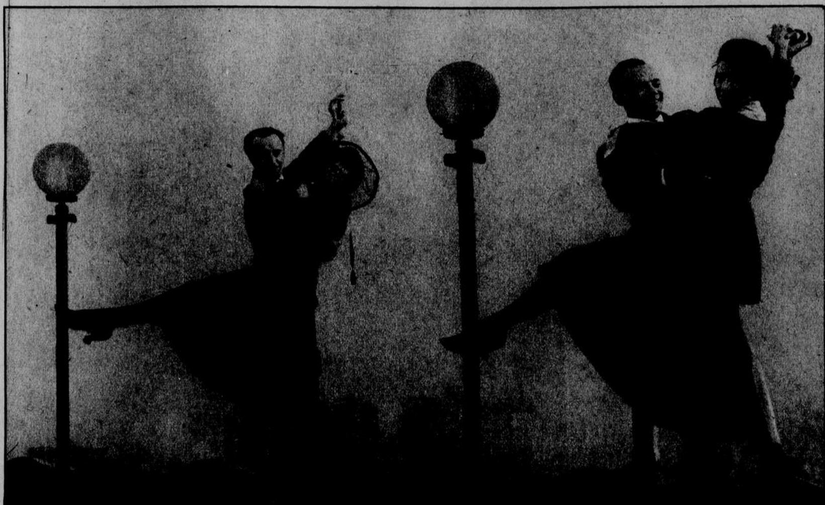
When the Dancing Teachers Held Their Convention Recently in a New York Hotel They Performed a Lot of Unusual Stunts, Not the Least of Which Was This Rather Perilous Balancing Feat on the Edge of a Roof "Several Miles Above the Street."