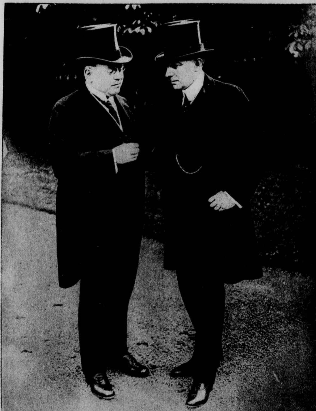
Two German Leaders of Whom America Now Is Hearing Much. At the Left, Matthias Erzberger; at the Right, Karl Helfferich.