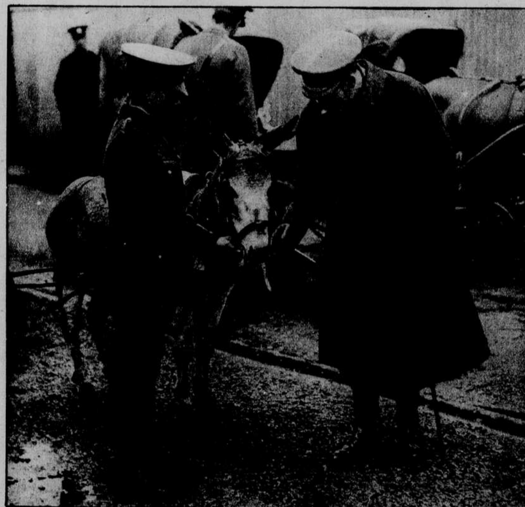
King George of Late Has Been Seeing Things at First Hand, Both in France and in England. Here He Is Enjoying a Call Upon the Pet of the Red Cross Hospital at Netlev.