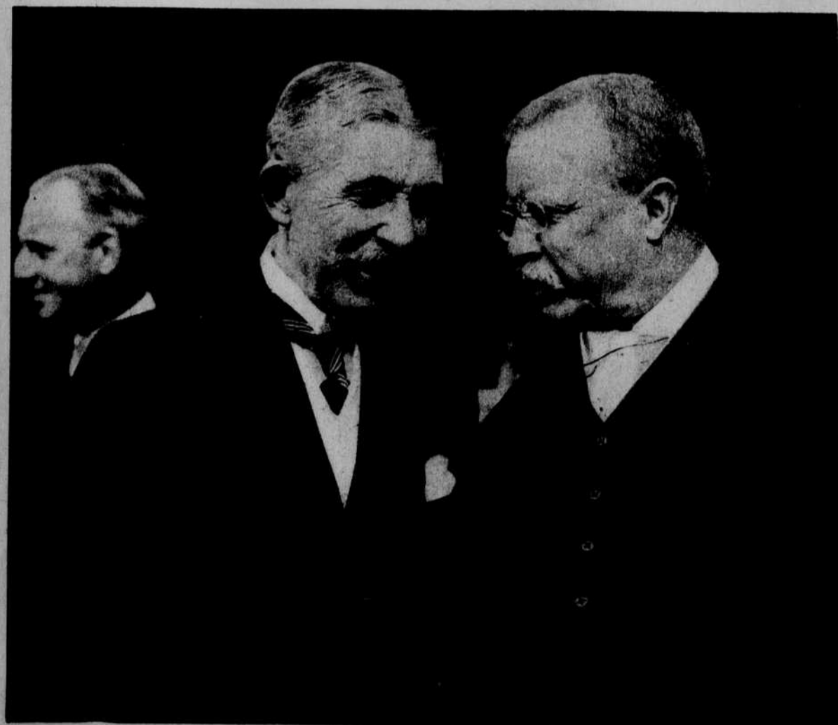
The Head of the Belgian Commission, Baron Moncheur, Has a Chat with "the Colonel" on the Lawn of the Roosevelt Home at Oyster Bay.