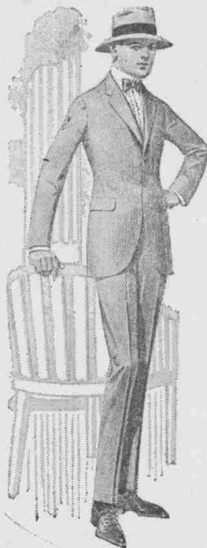
Save 3 to 8 dollars a suit. Wear the latest and smartest suits.