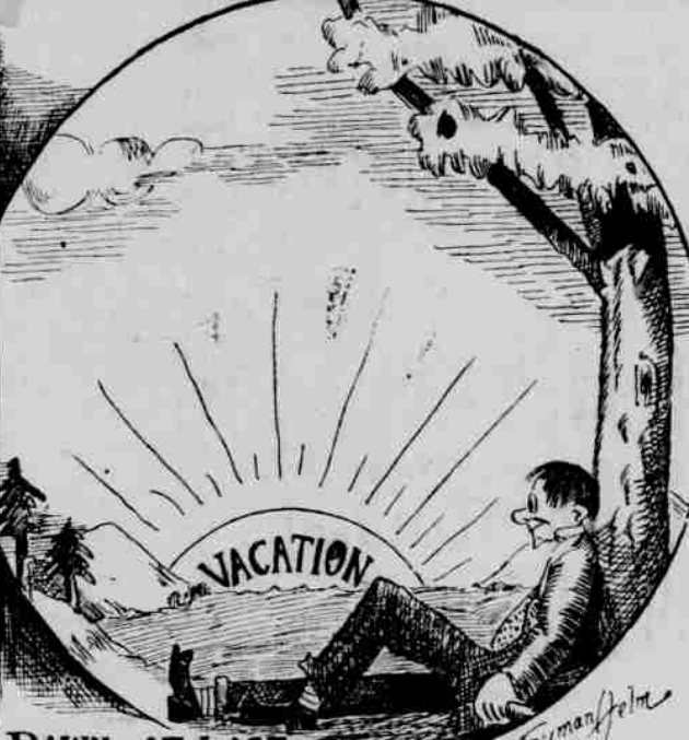
DAWN AT LAST.