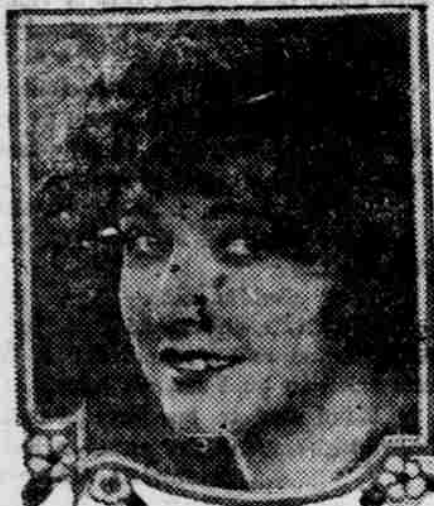
MAE BUSCH IN THE UNIVERSAL-JEWEL PRODUCTION "THE DEVIL'S PASS KEY"

husband in "Blind Husbands" has in "The Devil's Pass Key" the part of a talented American author living in Paris with his young wife, who gets deeply in debt to another—sets deeply in debt to an unscrupulous modiste. This woman expects the girl to get a rich lover to pay her bills and introduces her to a wealthy young American army officer. The American realizes young wife is unsophisticated and helps her out of her difficulties.