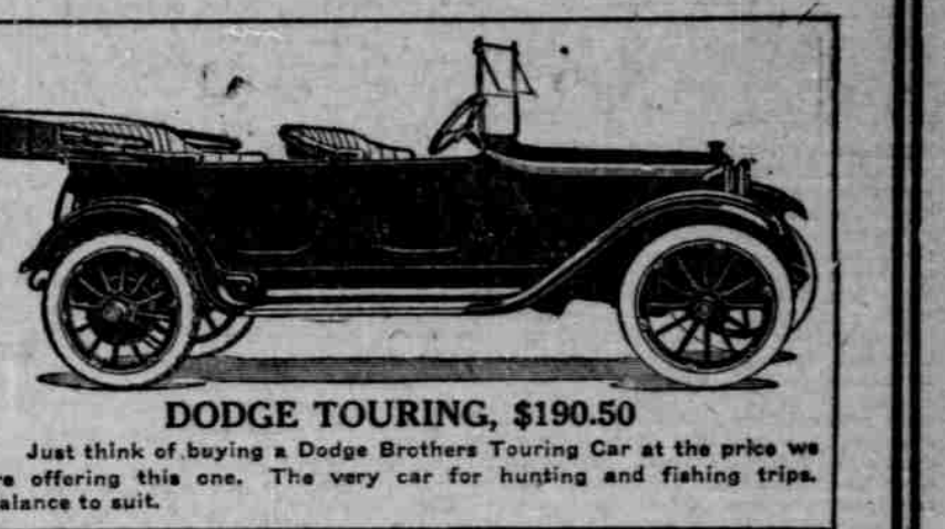
DODGE TOURING, $190.50 Just think of buying a Dodge Brothers Touring Car at the price we are offering this one.