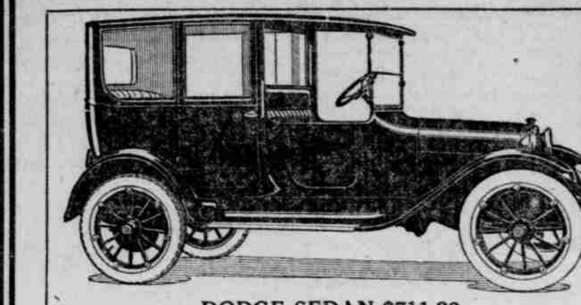
DODGE SEDAN $711.20 Here we have a Dodge Brothers Sedan. The car your wife and family have been after you buy for so long.

Our special selling plan allows you to drive the car for five days. If at any time during this period you become dissatisfied, you have the option of exchanging it on any other car we have in the house or apply the full purchase price on a new one.