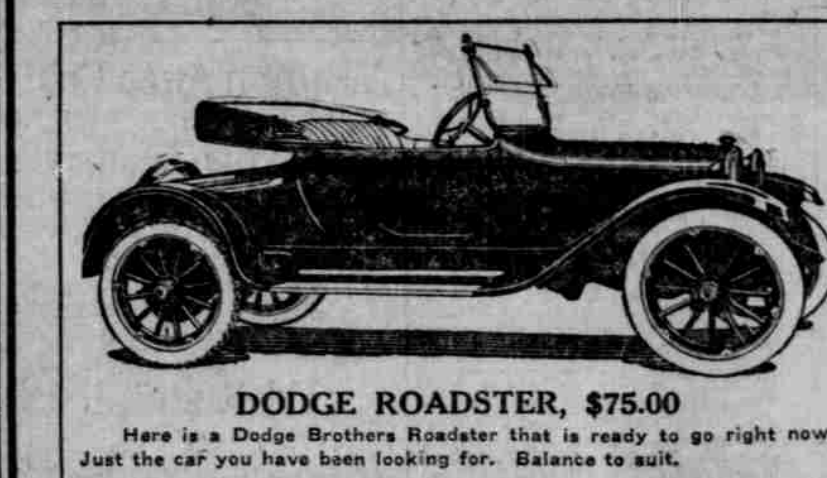
DODGE ROADSTER, $75.00 Here is a Dodge Brothers Roadster that is ready to go right now.

SATURDAY IS DODGE DAY. This day has been set aside for the sale of used and rebuilt Dodge Brothers cars. There is a fine assortment for you to select from, covering almost any style and price.