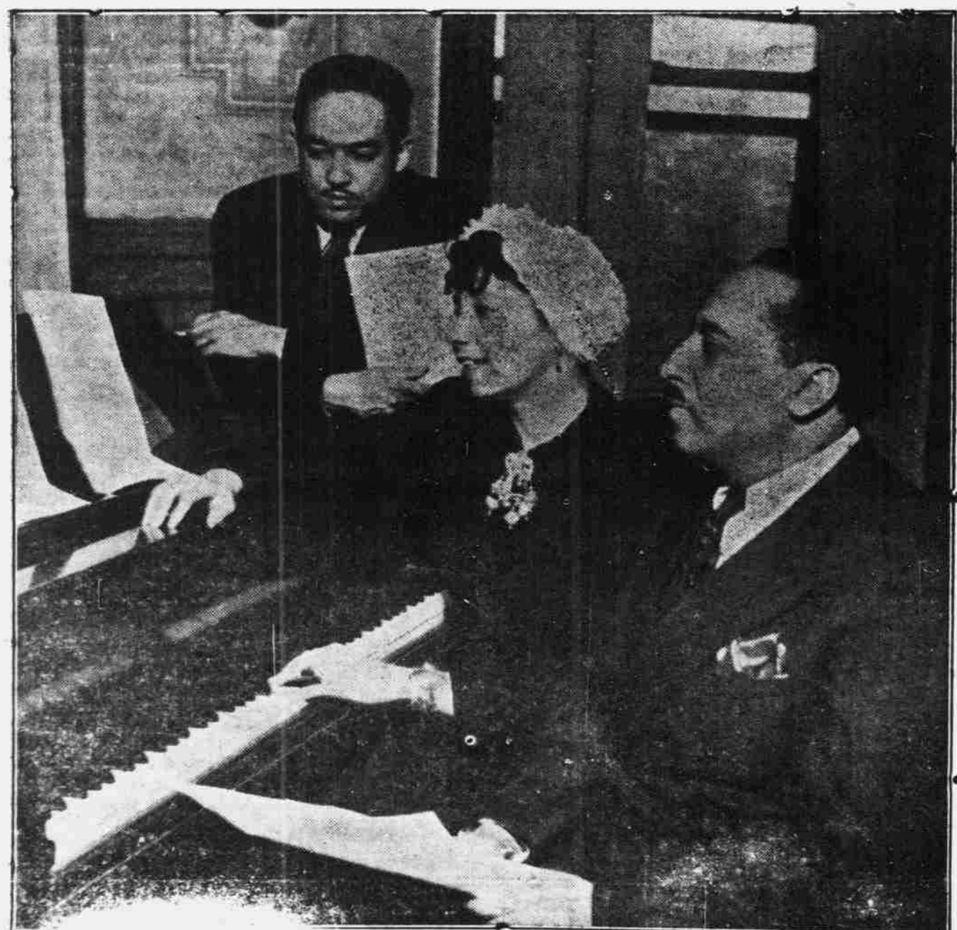
Langston Hughes, left, and Arna Bontemps, right, noted authors discussing with Miss Etta Moten, famous star of stage, screen and radio, songs for the gigantic "Cavalcade of the Negro Theatre" to be produced for the American Negro Exposition at the Chicago Coliseum between July 4 and Sept. 2. This stage presentation will portray the history of the Negro theatre from pre-Civil war days to the modern swing era and will have a large cast of stars, supported by members of the Federal Theatre in Chicago. Miss Moten will be in one of the leading roles. The Cavalcade has been prepared by Hughes and Bontemps, who have previously collaborated on stage productions.