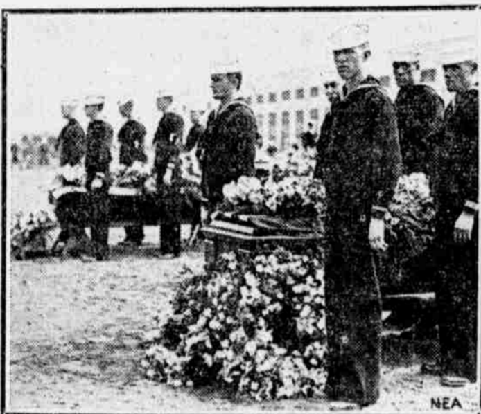
Sailors from the ill-fated vessel stood guard over the officers' caskets, set slightly apart from the other coffins during the services.

Here are the last solemn rites for the 48 officers and men killed in the explosion aboard the battleship Mississippi in San Pedro (Calif.) harbor. The flag-draped caskets, banked with flowers, lay in a hollow square of sailors. To the left of them sits a group of relatives of the dead. Under the magnovox tower, Rear Admiral Knouton is paying the navy's tribute to the men who died in line of duty.