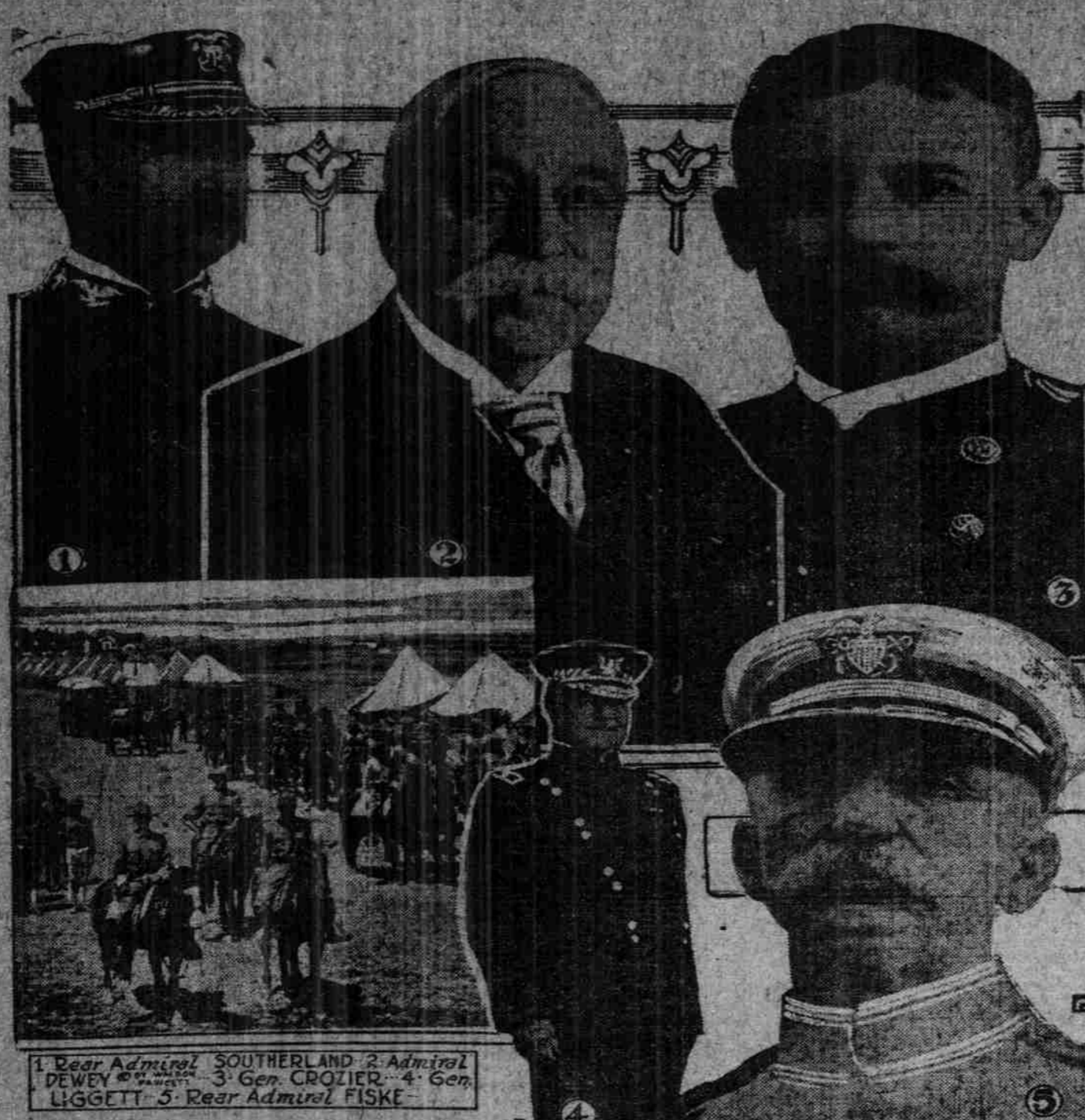
1-Rear Admiral DEWEY 2-Admiral SOUTHERLAND 3-Gen. CROZIER 4-Gen. LIGGETT 5-Rear Admiral FISKE

MEMBERS OF THE BOARD OF STRATEGY WHICH WILL PLAN CAMPAIGN FOR UNITED STATES