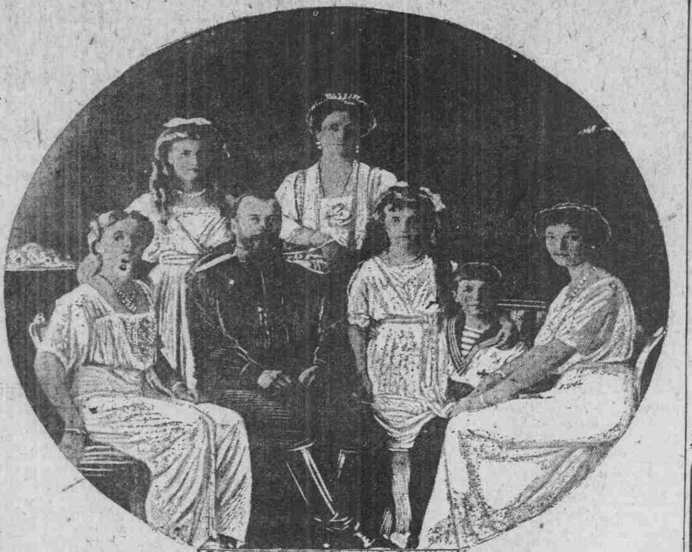
CZAR OF RUSSIA AND FAMILY This is the latest picture of the czar and his family. It is made doubly interesting by the new report of the engagement of the czar's eldest daughter, the Grand Duchess Olga, and by the many conflicting reports of the health of the little czarvitch. These in the group are, left to right: Grand Duchess Olga, Grand Duchess Marie, the czar, Czarina Alexandra, Grand Duchess Anastasia, the czar's wife, and the czar.