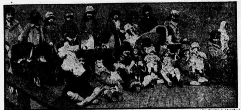
During Chicago Girls' week procession of dolls was staged. Dolls of every sort participated and affair was success. Photo shows one entry group.