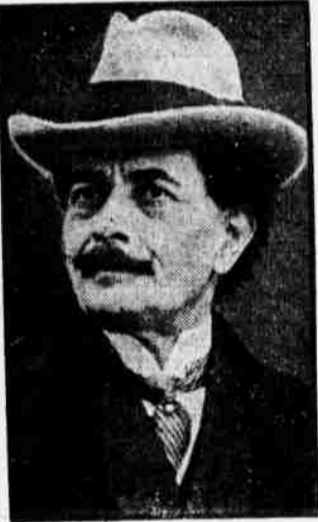
Bolivia's minister to Washington, Dr. Ricardo Jaimes Freyre, was among prominent arrivals from South America on recent trip of liner Western World to New York.