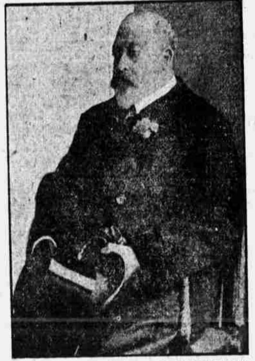
Become as stout as was Edward VII?