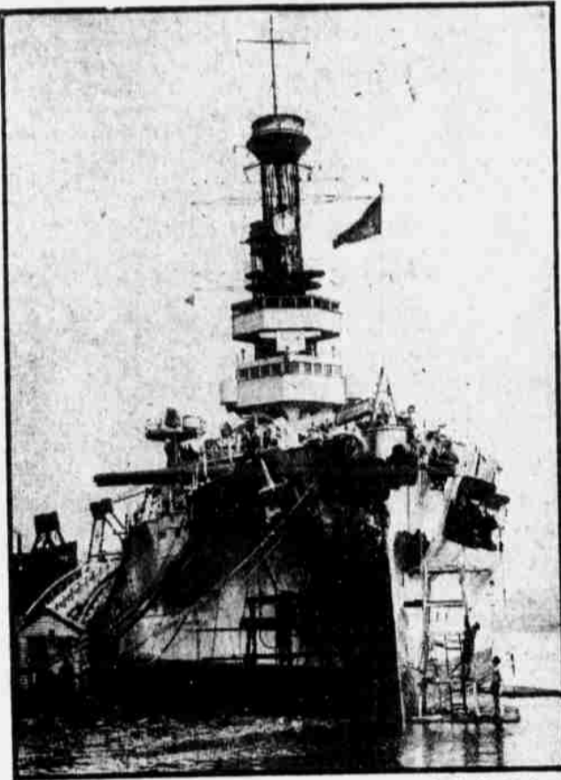
Scraping paint off U. S. battleship Arkansas in navy yard at Brooklyn, N. Y., is preparatory to acquisition of new coat and general overhauling.