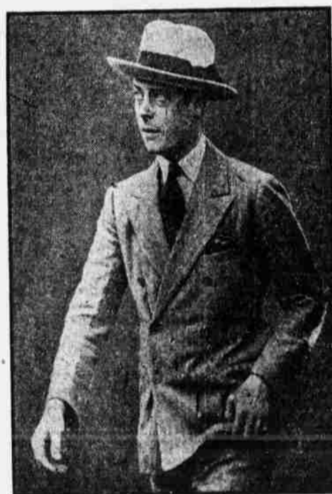
Will the slim Prince of Wales—The Prince of Wales, off on long trip again, is worrying about waistline, reports state. He fears corpulency of granddad, late Edward VII.