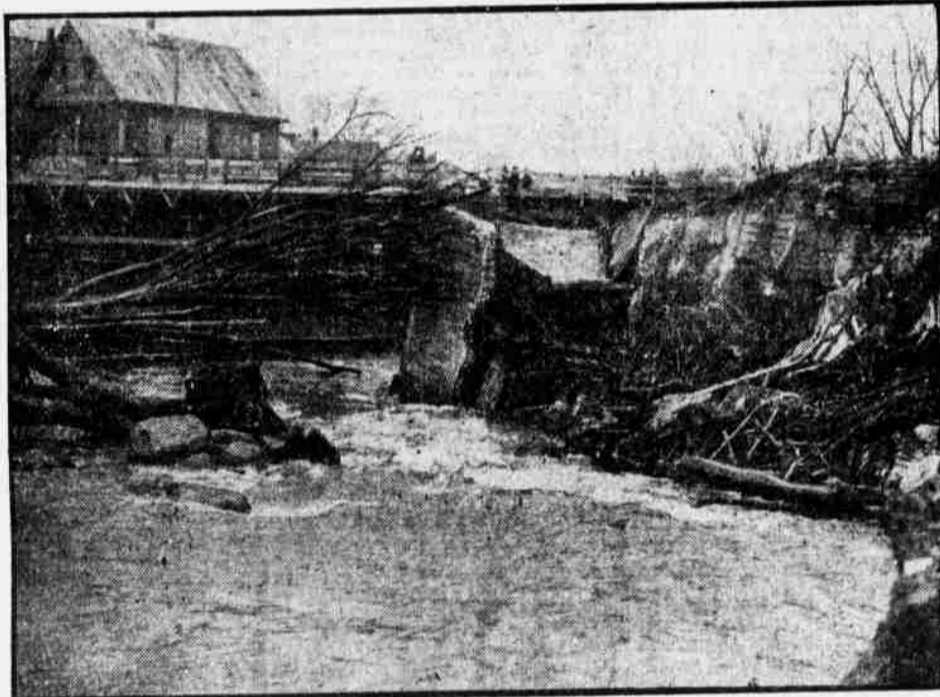
When river at Randolph, Vt., left banks, this house was burned because it was feared it would block river—forming sort of dam—and cause water to sweep town.