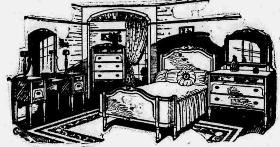
Charming in Design—Newest 3-Piece Suite in Beautiful Antique Walnut

This is one of the newest bedroom designs of the year, having arrived only a few weeks ago. Its style will be popular for many years to come. Finished in rich antique walnut. There are ten pieces to choose from. You may select as many or as few pieces as you wish now and add more pieces from time to time. We have grouped together three beautiful pieces, the dresser, chest of drawers, and bow end bed for only $119. Be sure to see all the pieces.