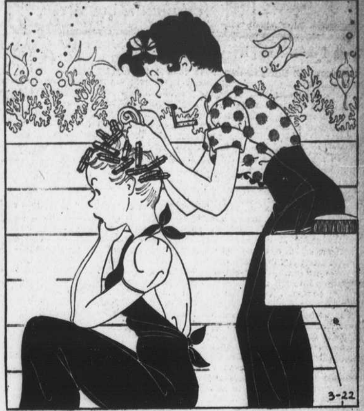
"He's a marvelous catch—gobs of money, a sophomore at Yale and a bachelor."

Copyright 1940 by NEA Service, Inc. T. M. Reg. U. S. Pat. Off.