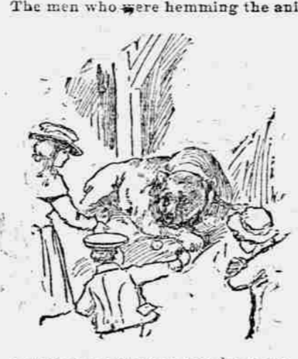
mal in on three sides began to fire when they were half a mile away.

When the bear had gained the shelf, where a raven's nest had been built for many years, the hunters were still unable to put up a good fight.