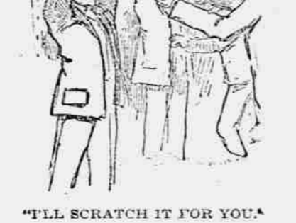
"TLL SCRATCH IT FOR YOU."

Years ago in California a traveler was on a stage coach that a pair of bandits went through. The 14 passengers were all made to get out and stand in a row, with their hands high over their heads.