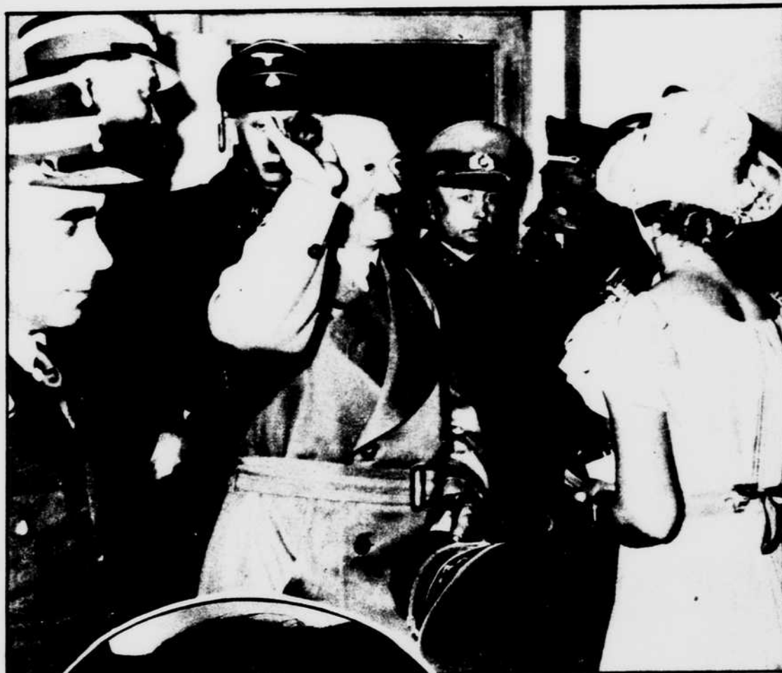
WITH A CLICK OF HEELS. Adolf Hitler gives the Nazi salute to a fair welcomer on arriving to view an international riding competition in Berlin.