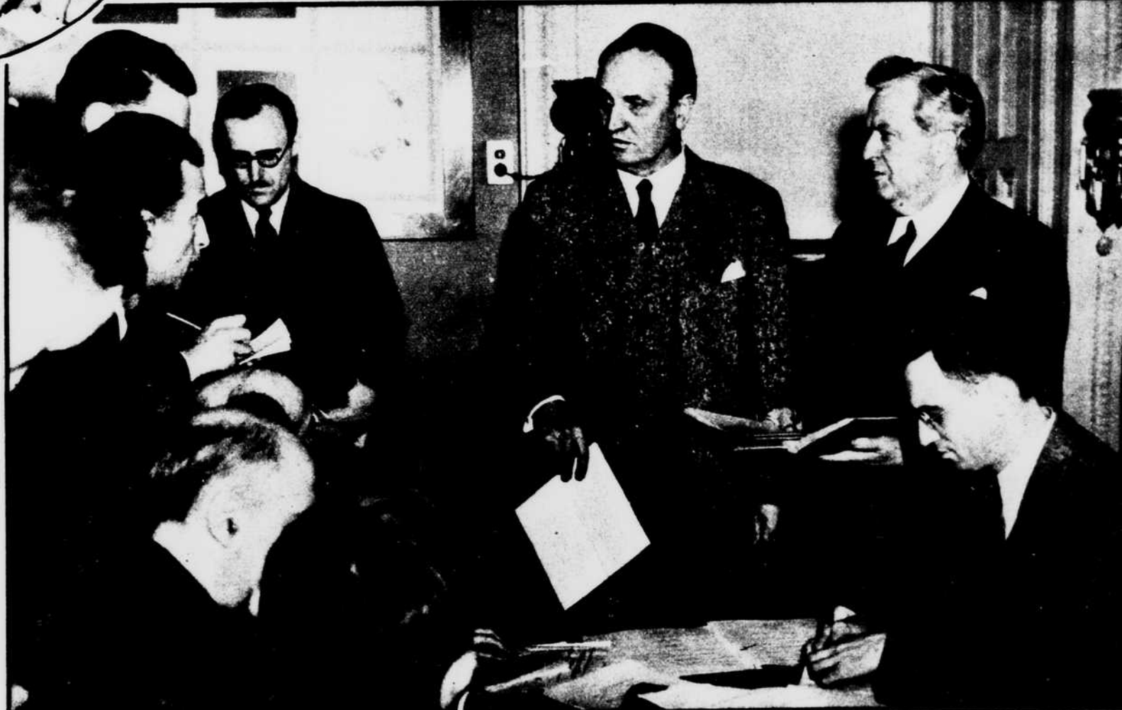
THE SUPREME COURT HOLDS THE HEADLINES. And the press hotly follows every break in the "big story" of the times. In the Senate Judiciary Committee, Chairman Ashurst (center) and Senator Pat McCarran give out the news of its favorable report on voluntary full-pay retirement for justices.