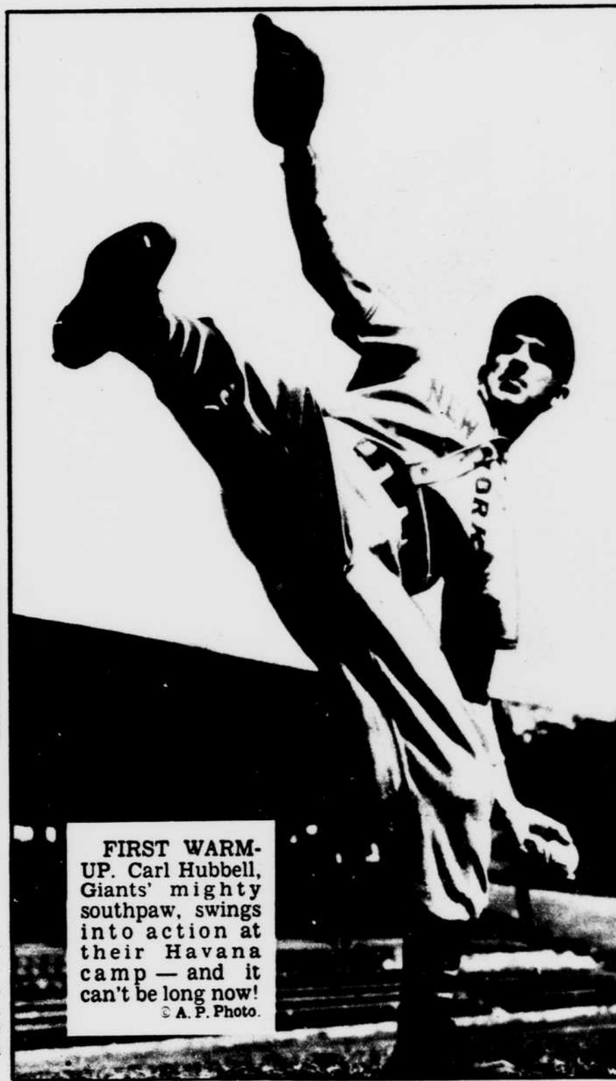
FIRST WARM-UP. Carl Hubbell, Giants' mighty southpaw, swings into action at their Havana camp — and it can't be long now!