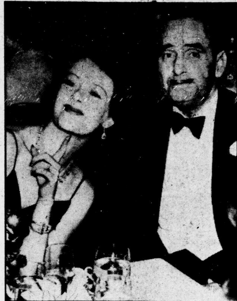
NEW YORK.—ESCAPE TENSION—Here from abroad to escape the tension of Europe, Douglas Fairbanks and his British wife, Lady Ashley, joined others at the Hotel St. Regis. Refusing to take things seriously, Mrs. Fairbanks was a finger alongside the stern visage of her husband.