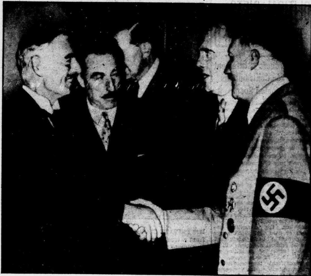
MUNICH.—ONE FOR HISTORY BOOKS—Hands clasped in friendship, Chancellor Hitler and Prime Minister Chamberlain are shown in this historic pose just after they had concluded the "Peace of Munich" that put a silver lining to the war clouds. Next to Chamberlain is Sir Neville Henderson, British Ambassador to Germany. Interpreter Paul Schmidt stands next to Hitler.

By the Associated Press. Maj. Gen. Harry H. Arnold, the Army Air Corps chief, said today American supremacy in developing military aircraft was threatened. "Until quite recently, we had marked superiority in airplanes, engines and accessories," he said in a letter to Air Corps officers and men. "That superiority is now definitely challenged by recent developments abroad." "This means that our experimental development programs must be speeded up." He gave no particulars, but informed persons said the Air Corps was concerned particularly over Germany's recent strides, especially the perfection of a fast, flexible single-seater fighter plane, the Messerschmitt. Earlier models of this plane helped give Gen. Franco an edge in the Spanish War. Gen. Ernst Udet, World War ace who is in charge of Germany's present production program, is credited with traveling 381 miles an hour in a later model. Britain's newest fighter, the Spitfire, also is reported to have attained tremendous speeds—in one instance well past 400 miles an hour, though with a following wind. This country's latest development is the Bell "Aircuda," a plane with a pusher propeller, bristling with machine guns.