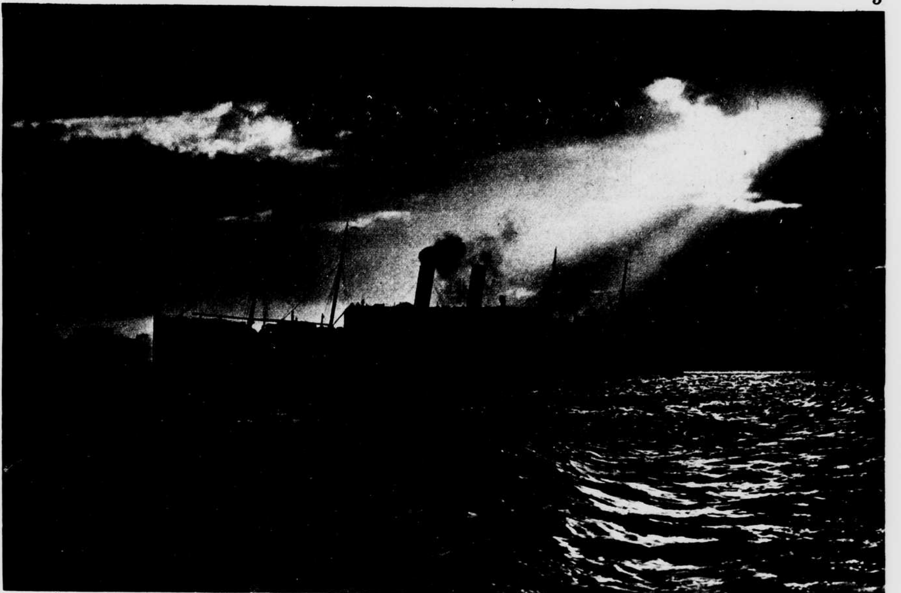
A storied ship of war, seizure, long disuse and now service again is the 35-year-old liner America. Here the 21,329-ton vessel makes a rare sea silhouette as she steams up New York Bay to Brooklyn shipyards for final outfitting as a United States Army transport. A proud liner when she was seized from Germany in 1917, the America was one of the dingy hulls whose days were thought ended when she rode at anchor for years at the mouth of the Patuxent River.