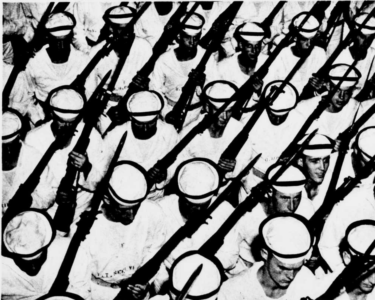
An early military drill in the naval careers of these plebes shows room for improvement. Given a few weeks' instructions by veterans, and the precision for which Naval Academy drills are noted prevails. The blue brims on the sailor caps denote the wearers' status as midshipmen.