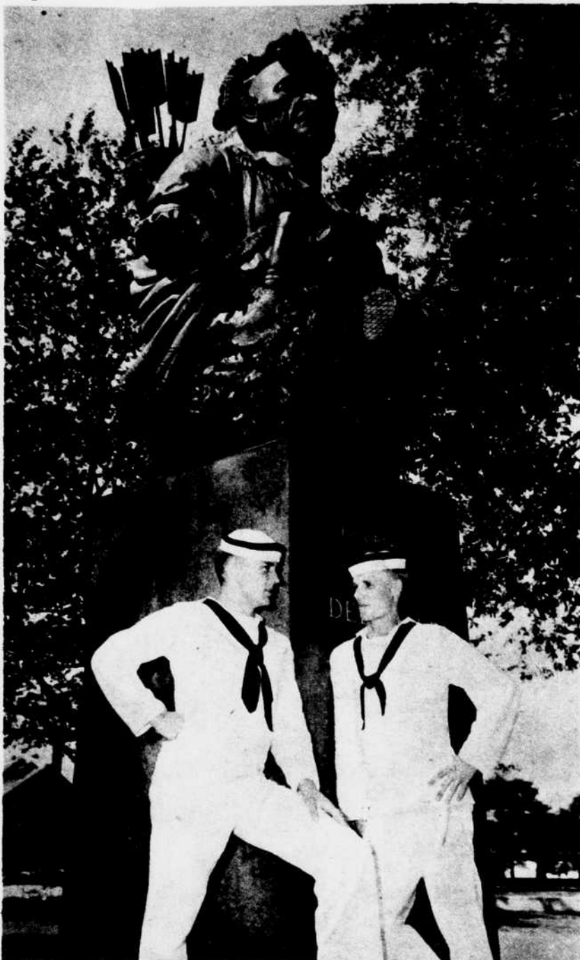
Midshipmen stand before Tecumseh, god of the campus at the Naval Academy. Annapolis is celebrating its centennial and the statue, a replica of the figurehead on the battleship Delaware, stands as a symbol of Navy tradition. Pennies are tossed to it by middies going to exams, and football teams worship its spirit for a victory over West Point.