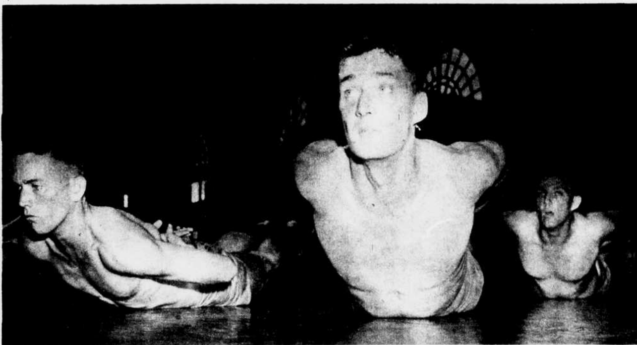
Gymnasium period in Annapolis' super-gym keeps midshipmen in fine physical condition for the strenuous routine at the Academy.