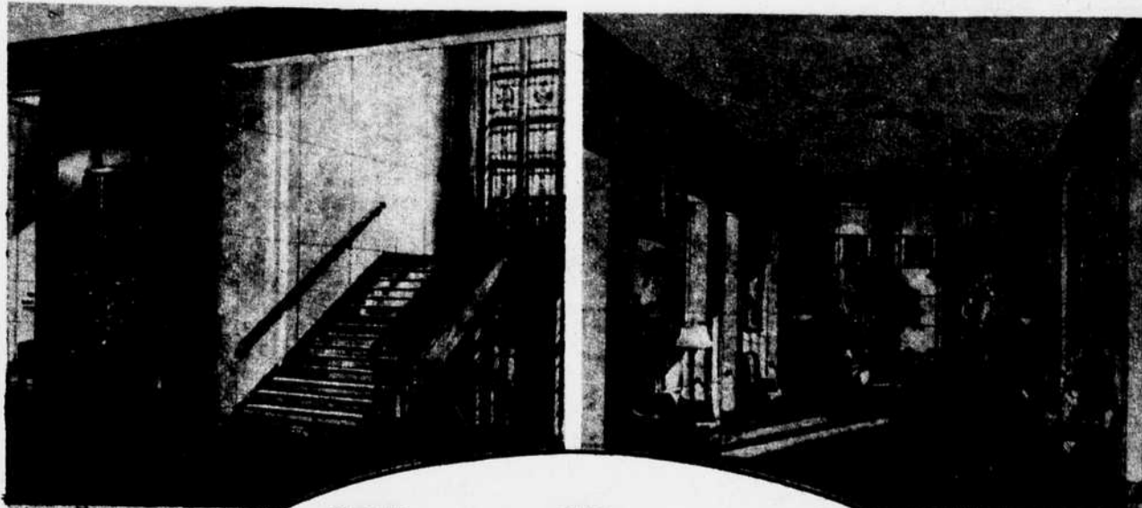
The Central Stair Vista