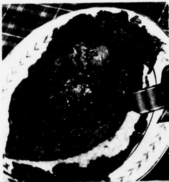
"Different"! Cook 4 lb. slice Swift's Branded Round Steak as for Swiss Steak, adding 2 c. cooked tomatoes. Cut in half; serve sandwich style, filled with mashed potatoes.

WHATEVER THE CUT you're buying—round steak for the family or a lordly rib roast for guests—it's easy to make certain of tenderness and fine flavor. Just buy your beef by a Swift brand name, the way you buy America's favorite ham and bacon. Swift's Premium, Swift's Select, Swift's Arrow . . . those are the three top brands. Right on the meat, they identify pick-of-the-market beef, selected for best eating by men who really know. So—to get beef that's downright delicious—always look for a Swift brand name.