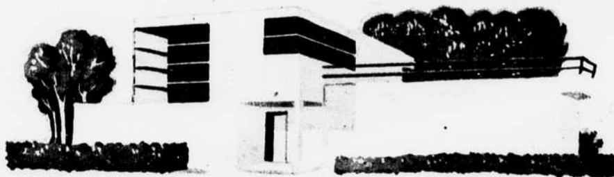
6 Latest thing in streamlined homes has sun deck, large windows