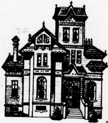
1 You could get lost in this jigsaw-puzzle house, a product of the fabulous Gay Nineties