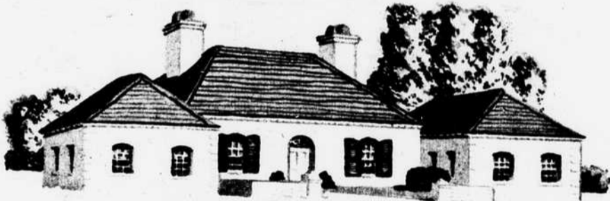
4 A rambling setup, it's centuries old, has a tiled roof