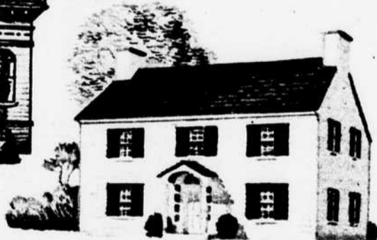
2 Still popular, this simple style is ideal for cool climates