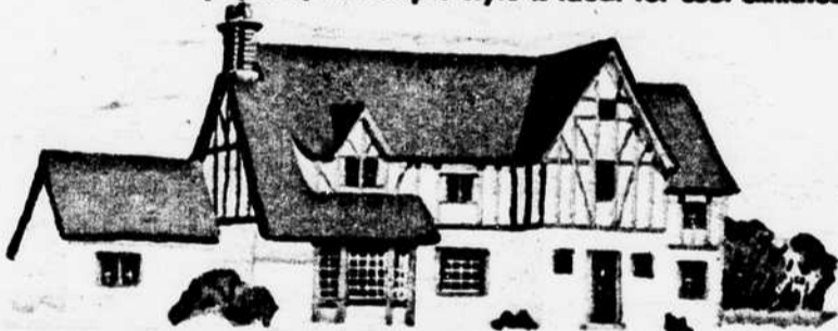
3 This old-world home is half timber, with leaded-glass windows