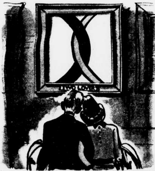
Drawings by Gregory d'Alessio