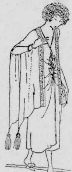
Crepe Meteor Negligee at 28.50