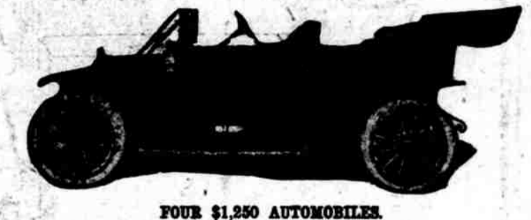
FOUR $1,250 AUTOMOBILES.