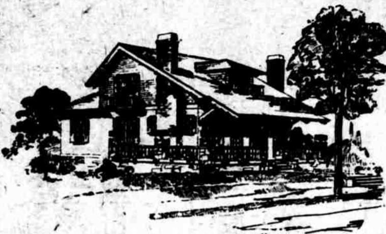
THE GRAND AWARD IS A $5,000. HOUSE AND LOT.