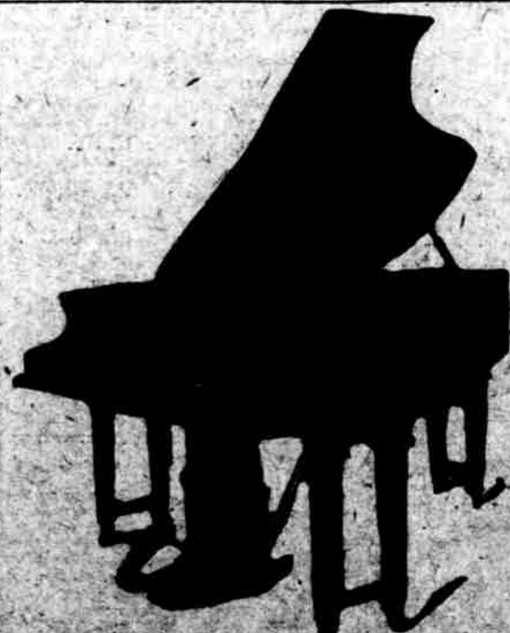
Four $750 Converter Baby Grand Pianos from Henry & Foster Piano Co., 1330 G St. N. W.