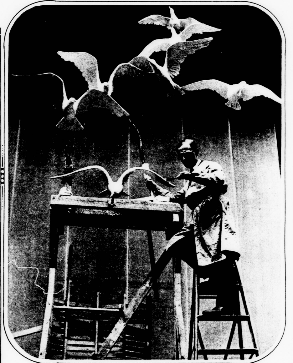
Sculptor Begni del Piatta at work on the model of the Navy and Marine Memorial which will be placed in Washington. The gulls, in the completed group, will be poised about 40 feet above an ocean wave. It is estimated that 150,000 Americans have contributed to the building of the memorial.