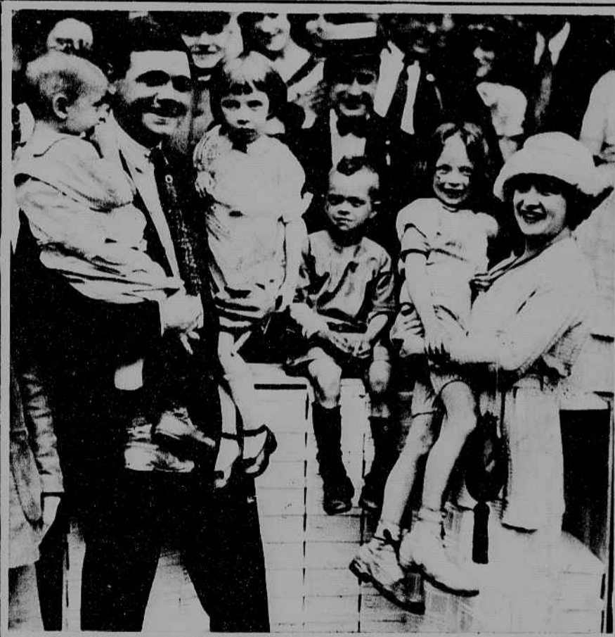
The children at the Catholic Orphan Asylum have ample reason to be interested in "Babe" Ruth's batting average, for when the Nemours Trading Corporation offered him a pair of shoes for every home run he knocked, "Babe" decided to donate them to the orphans. Here's the celebrated "King of Swat" and "the Missis" surrounded by a grateful group of kiddies at the Grand Central Palace.