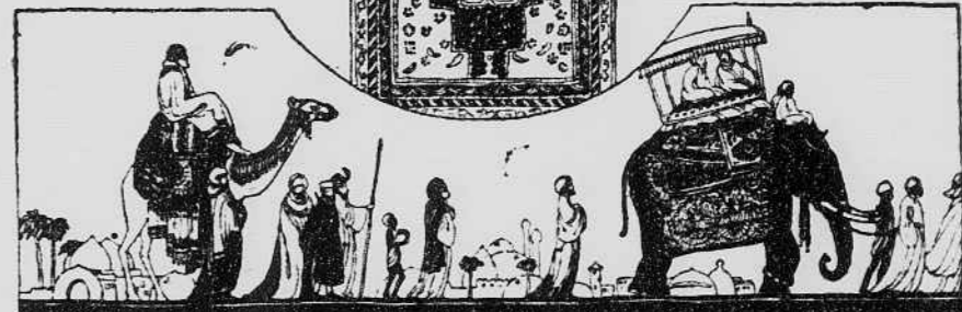
GIMBELS RUG STORE—Sixth Floor