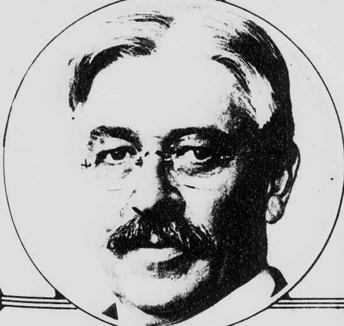
FORMER JUDGE NATHAN L. MILLER, OF SYRACUSE. A new picture of the designer of the Republican State Convention for the Republican nomination for Governor. Mr. Miller, who is sixty-two years old, retired from the bench because of need of a larger income and has been counsel for some of the leading upstate corporations.