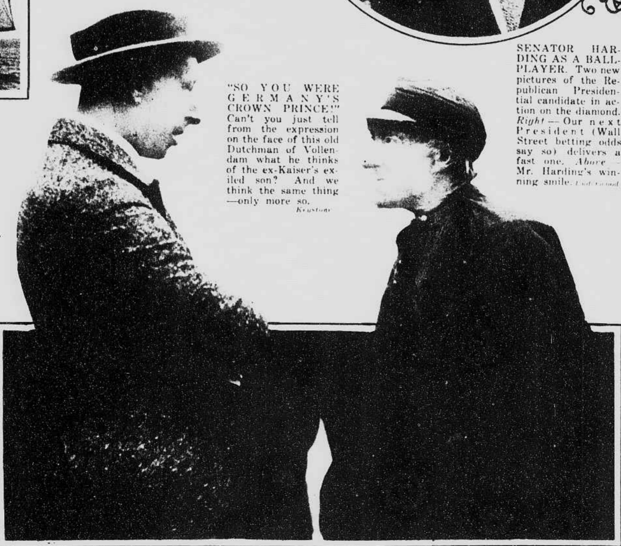
"SO YOU WERE GERMANY'S CROWN PRINCE?" Can't you just tell from the expression on the face of this old Dutchman of Vollenham what he thinks of the ex-Kaiser's exiled son? And we think the same thing—only more so.