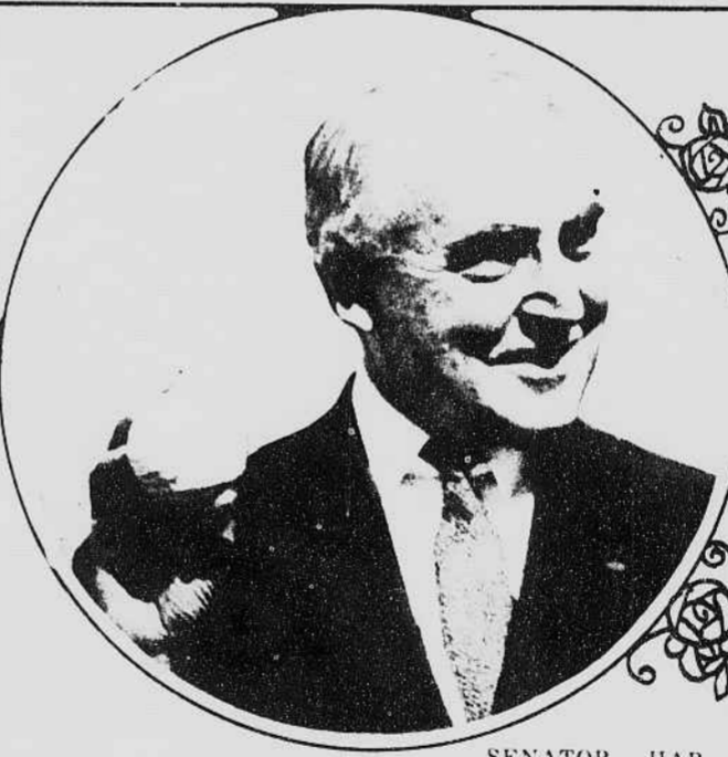
SENATOR HARDING AS A BALL-PLAYER. Two new pictures of the Republican Presidential candidate in action on the diamond. Right —Our next President (Wall Street betting odds say so) delivers a fast one. Above —Mr. Harding's winning smile.