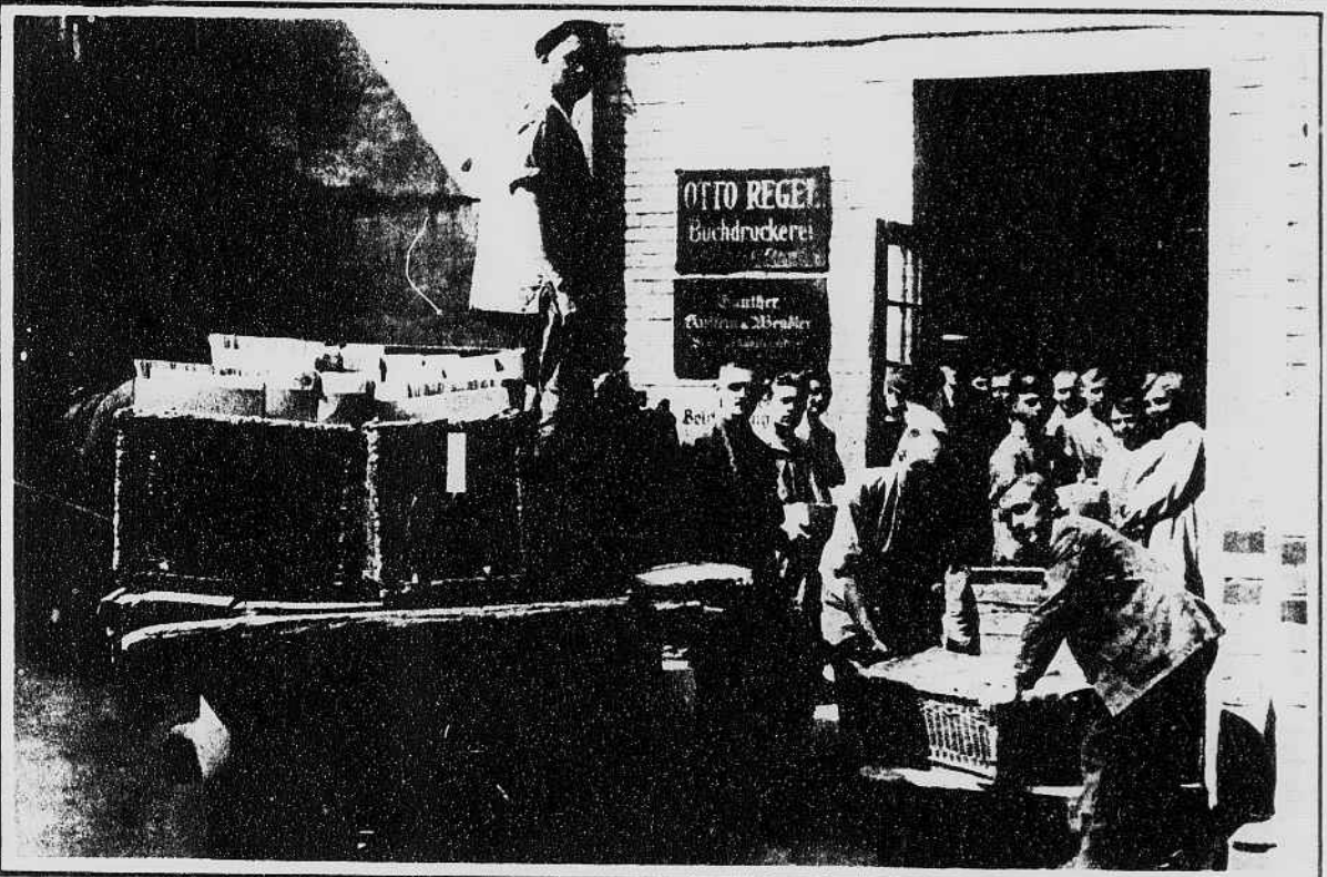
Right—THEY'RE STILL AT IT! Printers all over Germany are swamped with rush orders for propaganda, pro-Heinie literature which is being distributed all over the world in an effort to win back for the land of the iron cross the trade lost when they picked a scrap with the universe back in 1914. Here's a scene in the shipping room of one of their big propaganda printshops.