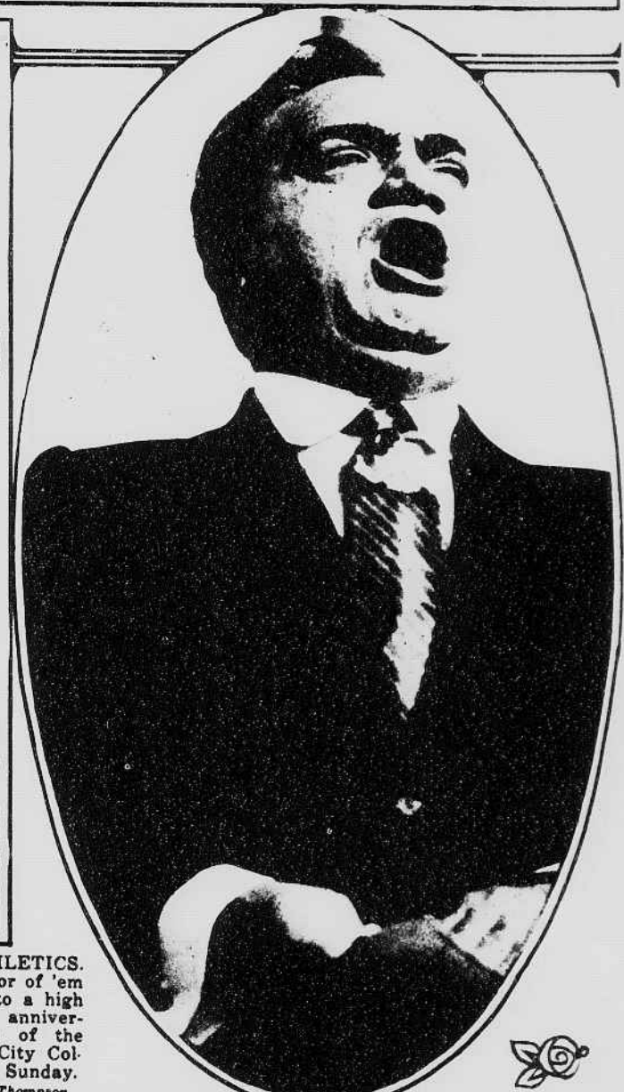
FACIAL ATHLETICS. The greatest tenor of 'em all hanging on to a high one during the anniversary celebration of the Fiume coup at City College stadium last Sunday.