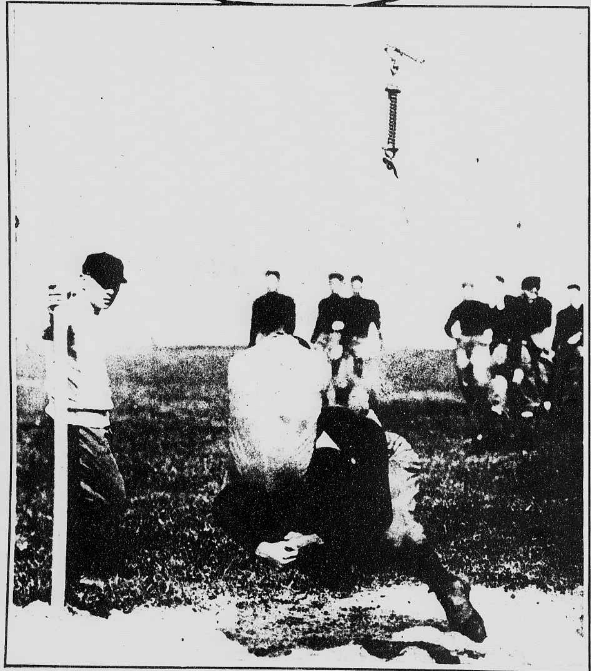
TACKLING THE DUMMY. It's football time again and here's a husky member of the Syracuse University squad slamming a sawdust halfback for a five-yard loss.