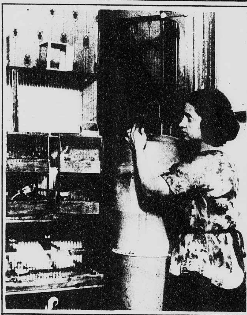
MUSIC LESSONS FOR CANARIES. A novel and successful compressed air and water device that operates whistle notes by the hour for the benefit of ambitious feathered songsters.