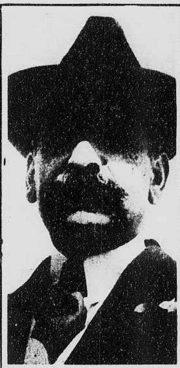
FELIX M. WARBURG, prominent New York banker and chairman of the joint distribution committee of the Jewish War Relief, who has sailed for Europe on a tour of the organization's various centers where millions of dollars worth of supplies of all kinds are being distributed to war sufferers.