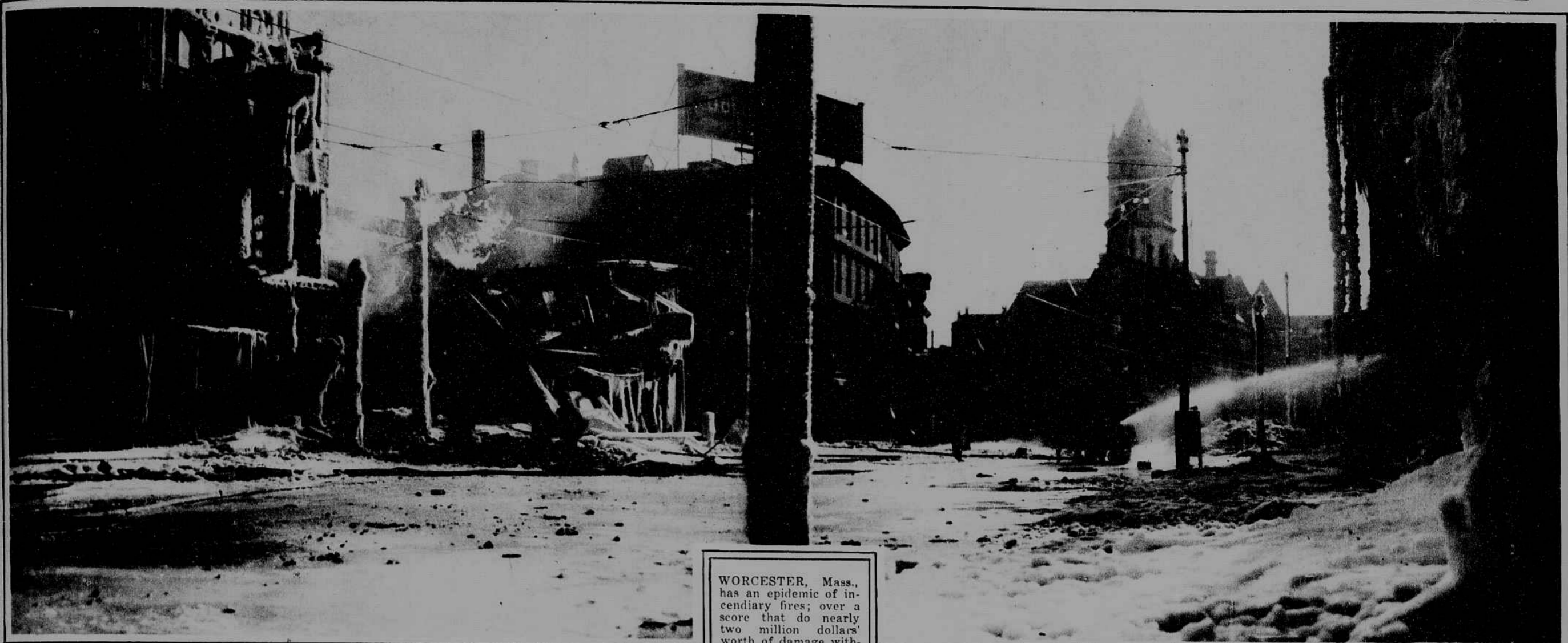
WORCESTER, Mass., has an epidemic of incendiary fires; over a score that do nearly two million dollars' worth of damage within twenty-four hours. Here is a view of Main Street showing the smoking ruins of some of the city's important business buildings with the tired firemen still wetting down the ice-covered walls. Zero weather made the fire-fighters' job a thankless one, and Worcester owes a debt to their heroic efforts that she can never quite repay.