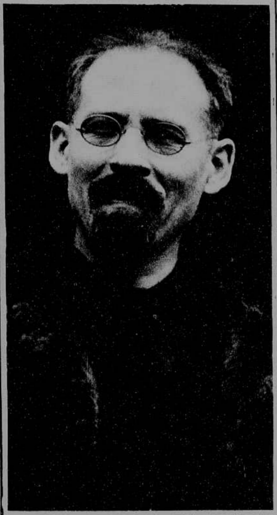
Right — SMILING WILL H. HAYS, chairman of the Republican National Committee, who is almost certain to be our next Postmaster General. K V