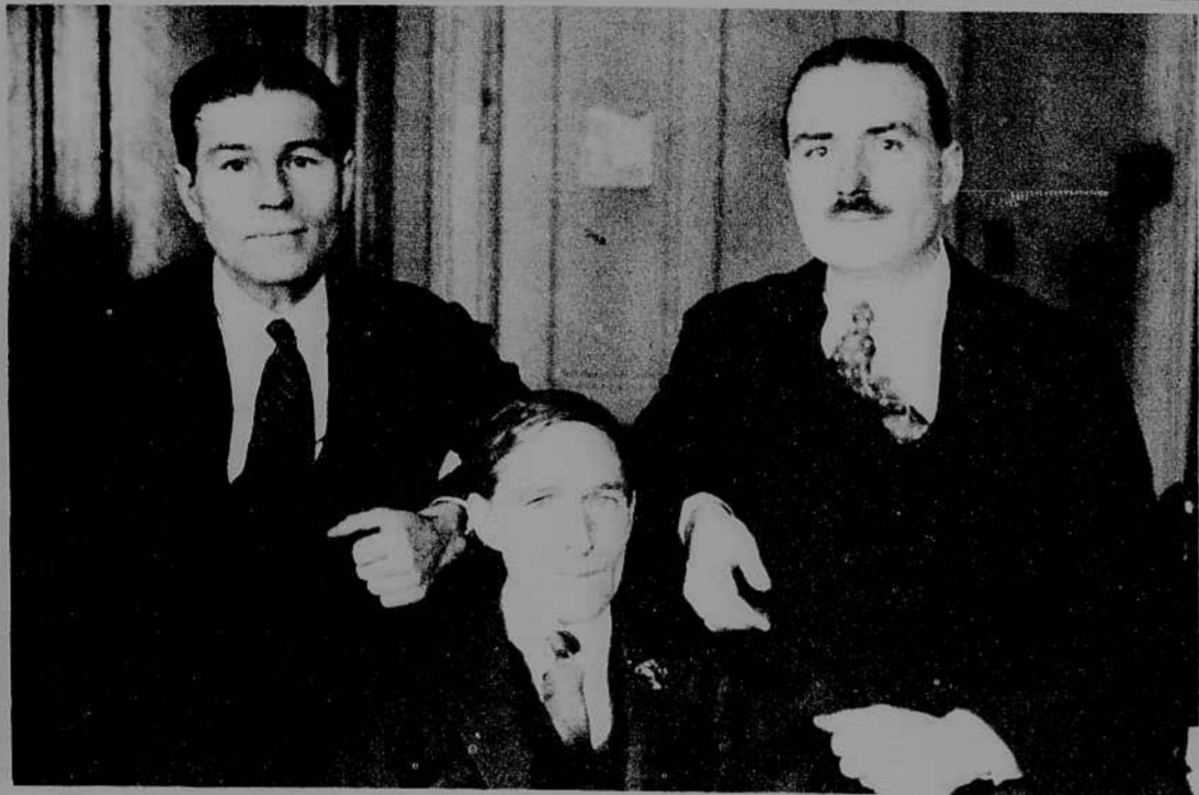
Left—THREE FAMOUS BROTHERS, each one of whom have made good with their pens. In the center Sir Philip Gibbs, writer, war correspondent and lecturer—at the right, Cosmo Hamilton, the famous author and playwright—at the left, A. Hamilton Gibbs, the well-known writer.

H THE It has long on skis. mountain above Switzer- play? the con- s "mon- he sur- the effort ply re- magnifi- anorama out be- far as each Ceylone