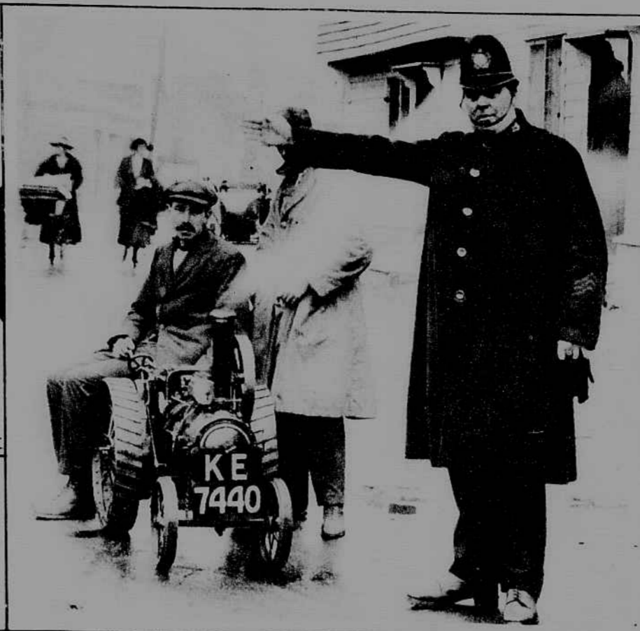
WORLD'S SMALLEST TRACTOR. A typical London bobby holds up the smallest engine in the world duly licensed for road transport—a perfect working model of traction engine built by three brothers, all agricultural workers, of Eynsford, Kent—pictured here traveling on the road under its own power.