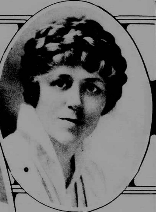
WHAT'S IN A NAME? Like any number of modern wives hereabouts, Doris Stevens, who is now honeymooning in Paris with Dudley Field Malone, has graciously but firmly refused to take her husband's name. No Mrs. for her—just plain Doris, if you please!