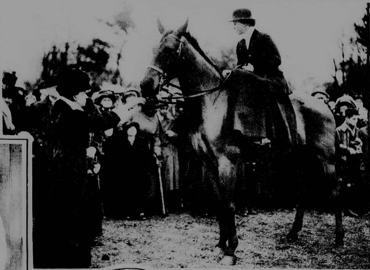
QUEEN ALEXANDRA chatting with her granddaughter, the Princess Mary, during a recent meet of the Norfolk Foxhounds at Sandringham, on which occasion members of the hunt, before the hounds moved off, presented the royal bride-to-be with one of the first of her wedding gifts.

H THE It has long on skis. mountain above Switzer- play? the con- s "mon- he sur- the effort ply re- magnifi- anorama out be- far as each Ceylone