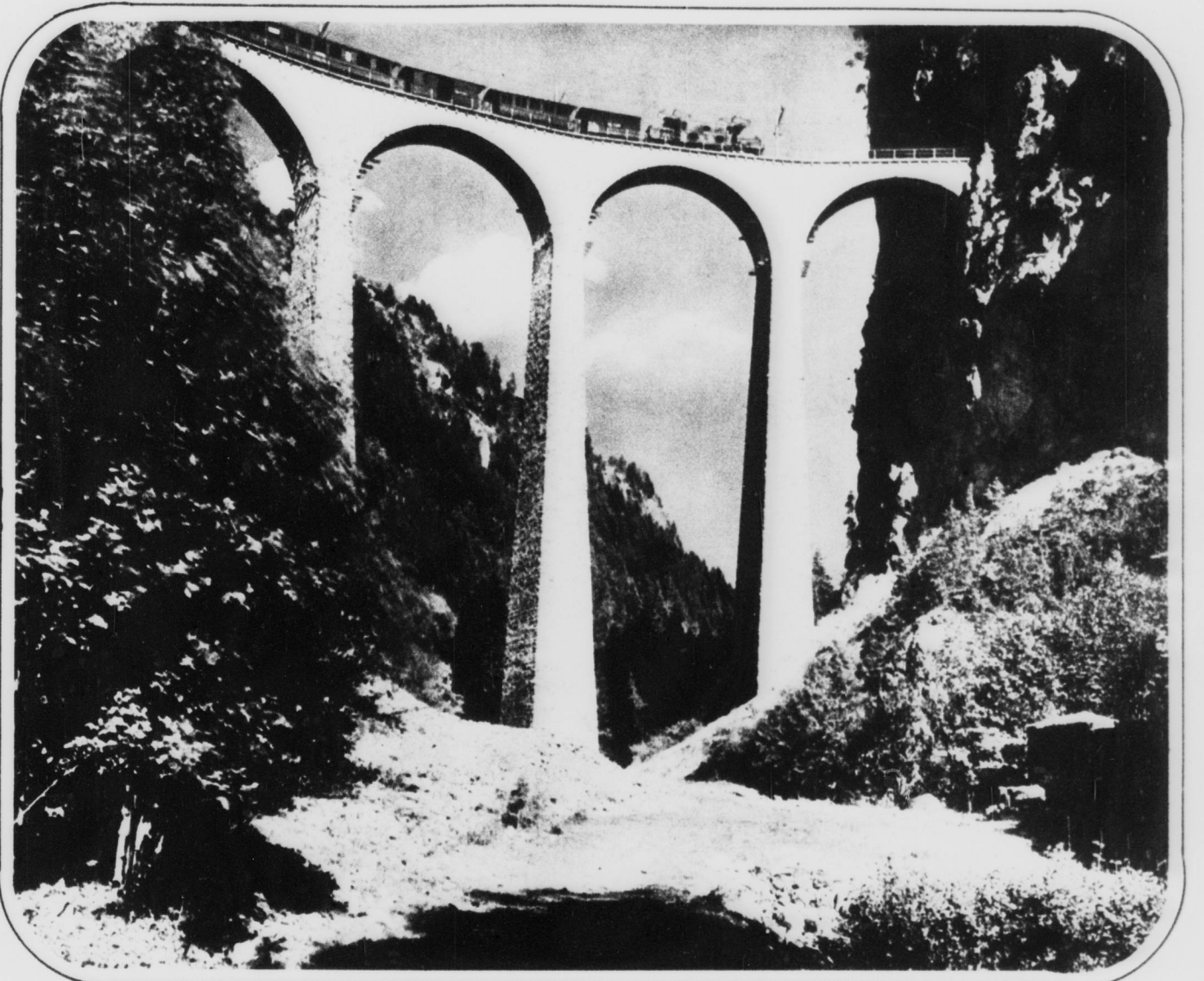
Scenes in the Swiss Alps. Left: The town of Interlaken lies in the shadow of some of the highest peaks of the Alpien Range. The white-capped heights of Jungfrau rise in the background. Right: The Alps provide not only scenery but serious problems for the railroads. This towering stone viaduct is one of the engineering triumphs on the Rhaetian Railroad.