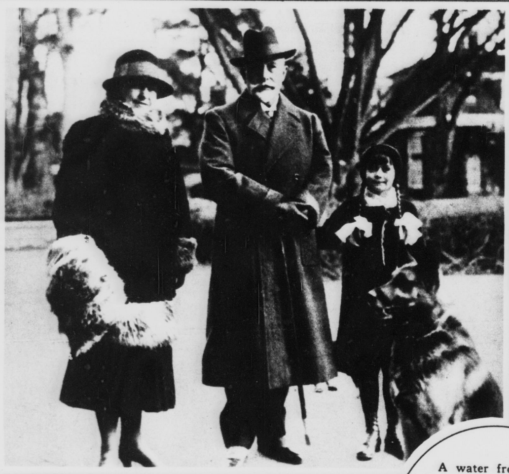
On a morning stroll at Doorn. A recent photograph of William II, former German Kaiser, with his wife, the Princess Hermine, and her youngest daughter, Princess Henriette.