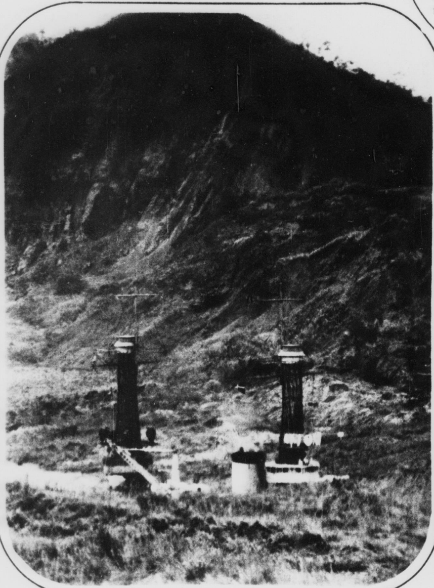
This is not a buried battleship, but the U. S. S. Mississippi passing through the narrow Gaillard Cut in the Panama Canal. The photo was taken from a high bank of the cut.