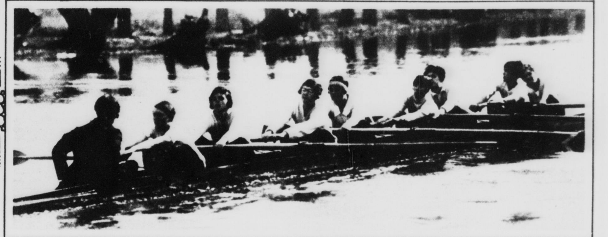
A hard pull for Oxford. The women's crew of the English university training for their annual race with the fair Cambridge eight.