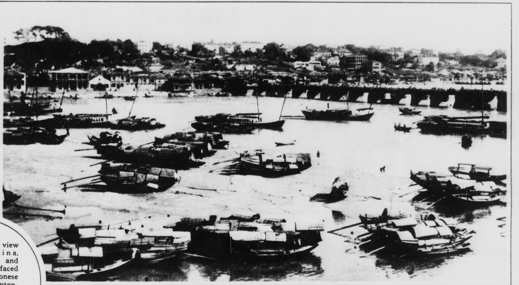
A water front view of Nanking, China, where Americans and other foreigners faced peril during Cantonese outrages. The Cantonese troops were shelled by American and British warships from the river.