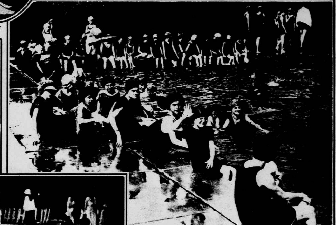
At the shallow end of the pool.