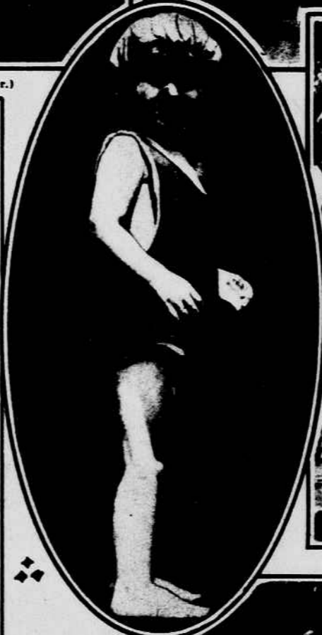
The tiniest bather at the pools.