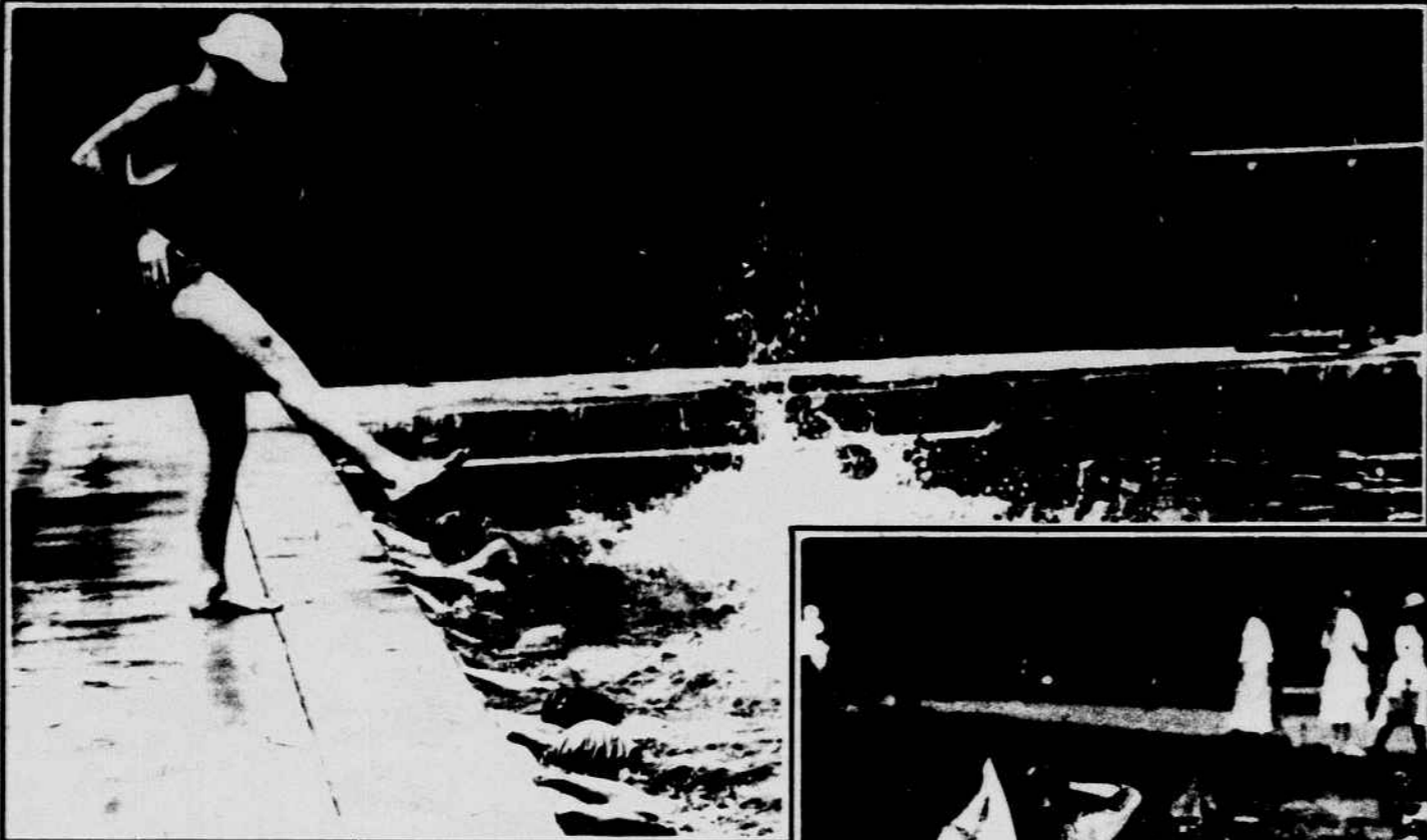
"Keep both feet going," calls the instructor.