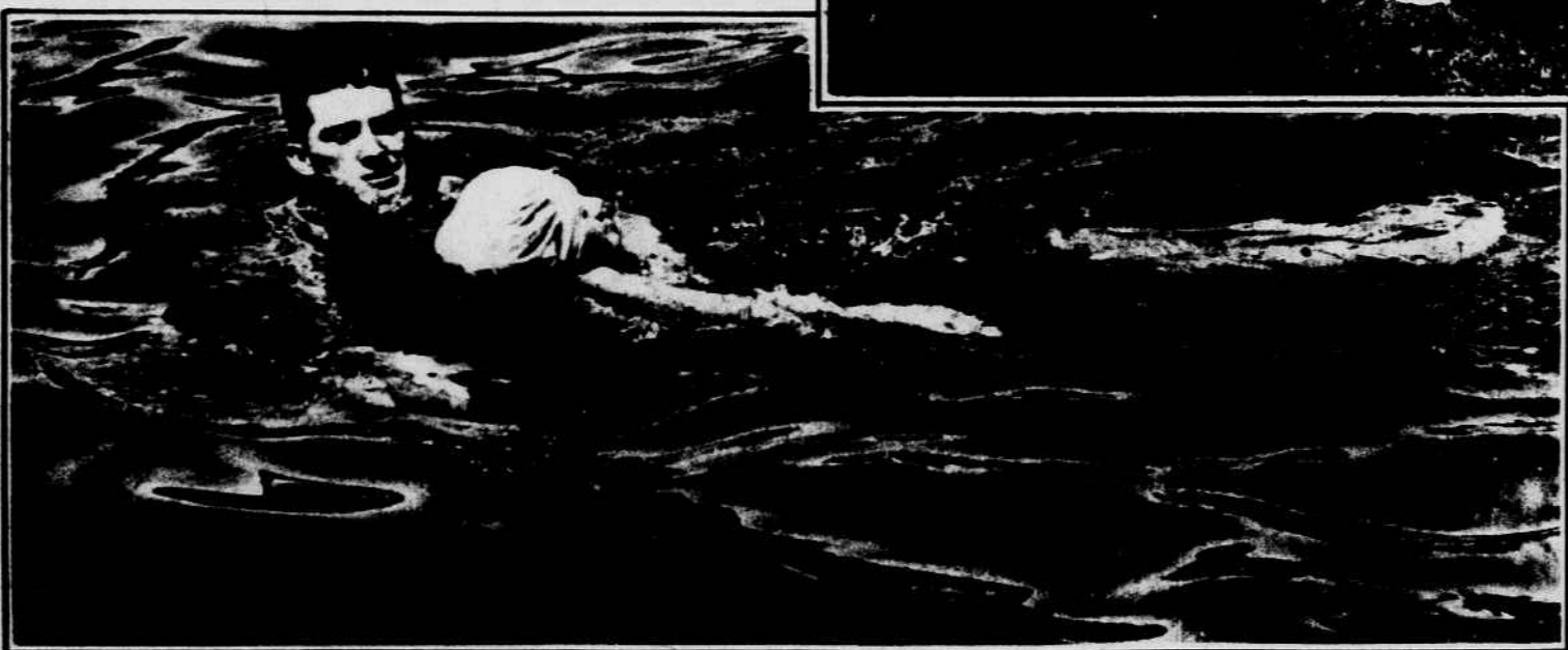
A lesson in life-saving.