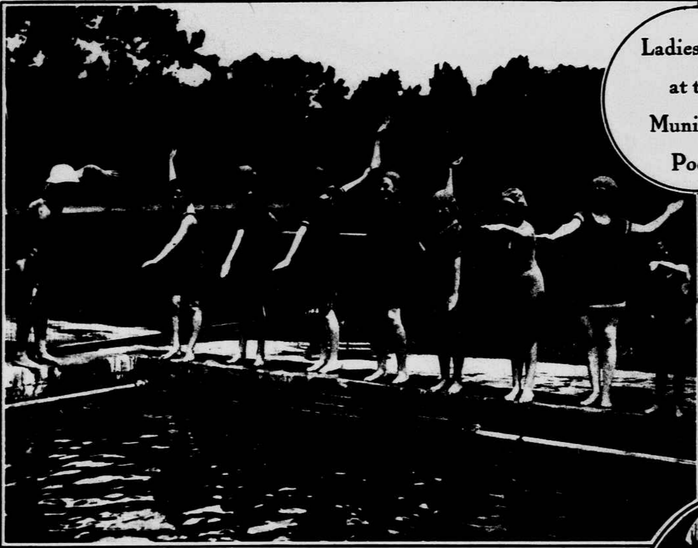
Instructor teaching arm movements.