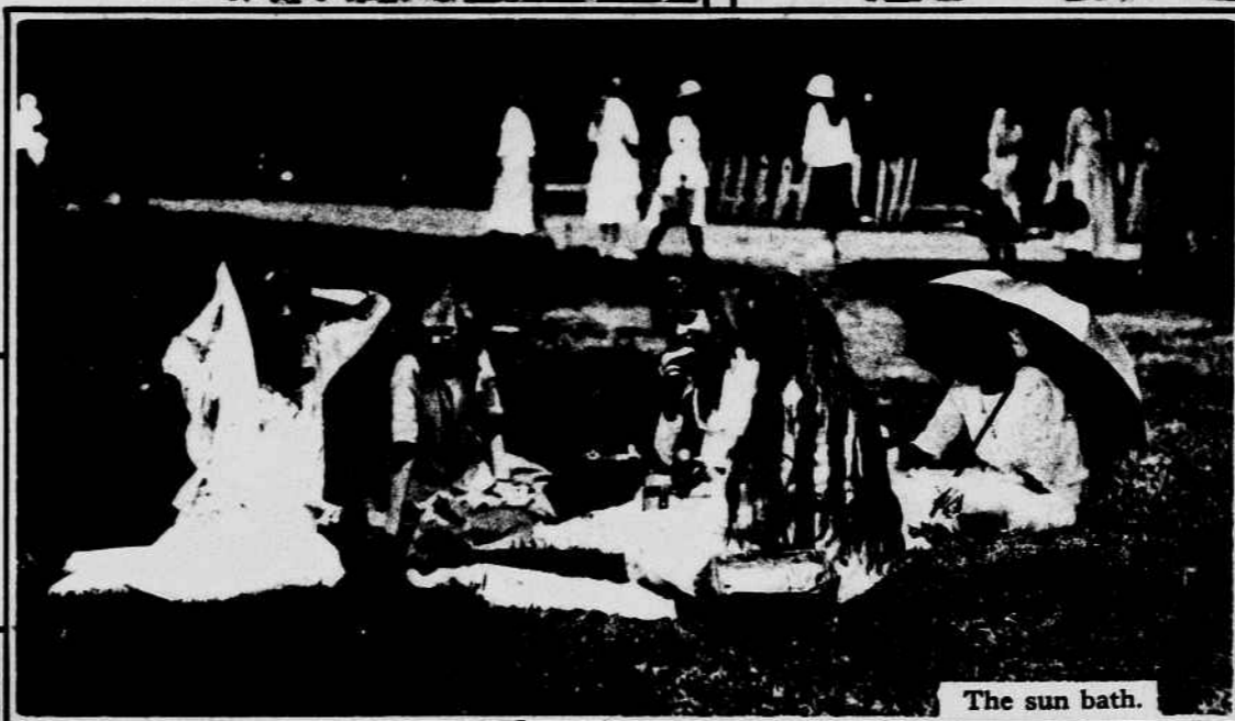
The sun bath.