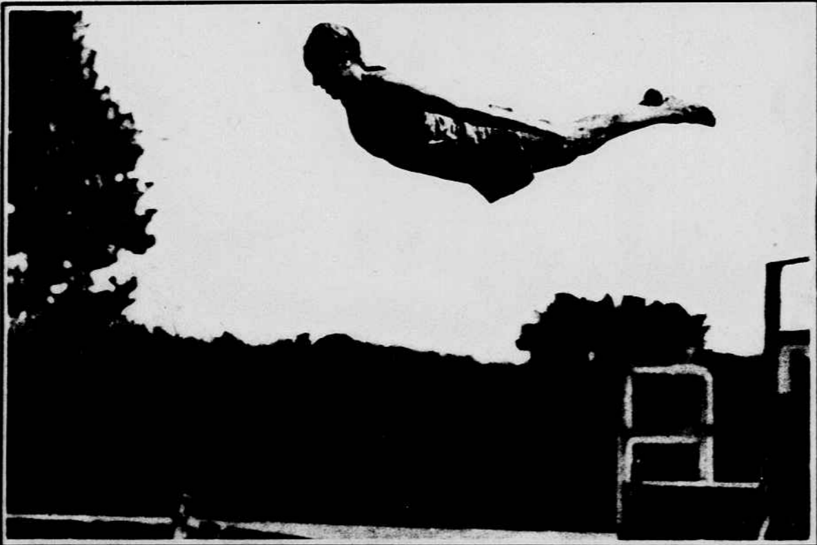
Caught in midair.