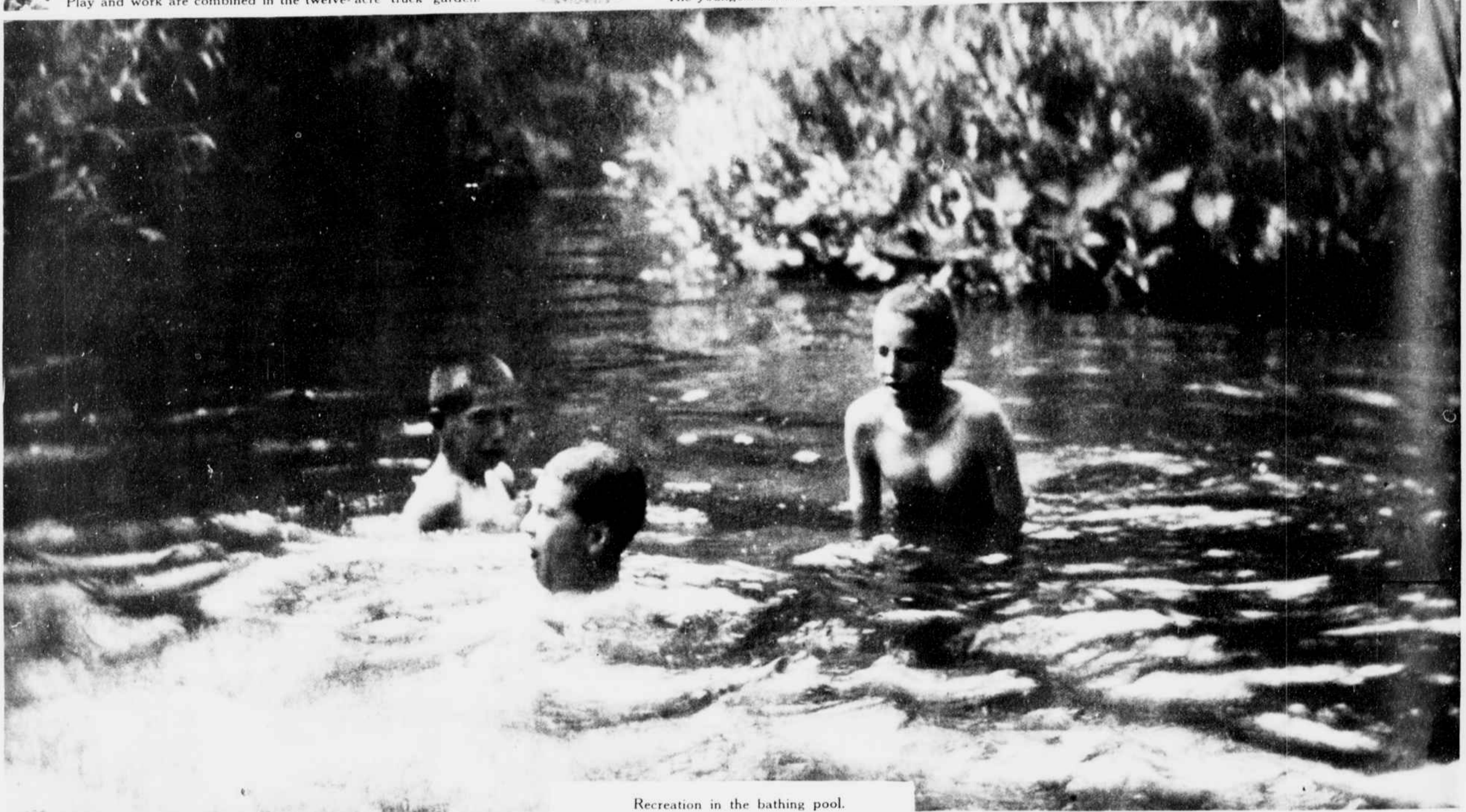
Recreation in the bathing pool.