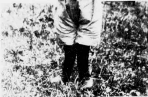
The youngest inmate.