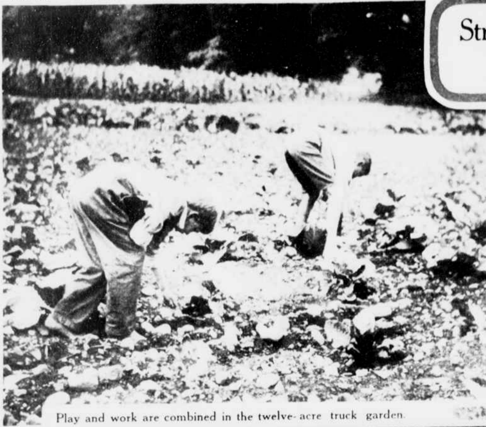
Play and work are combined in the twelve-acre truck garden.