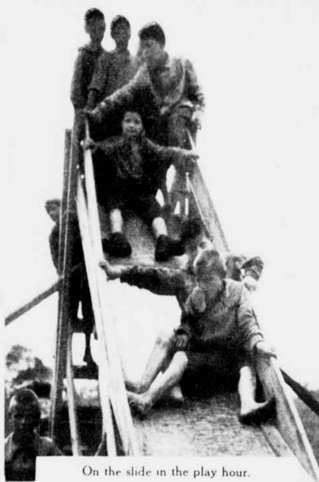
On the slide in the play hour.