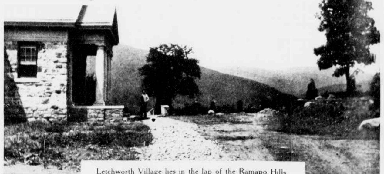
Letchworth Village lies in the lap of the Ramapo Hills.