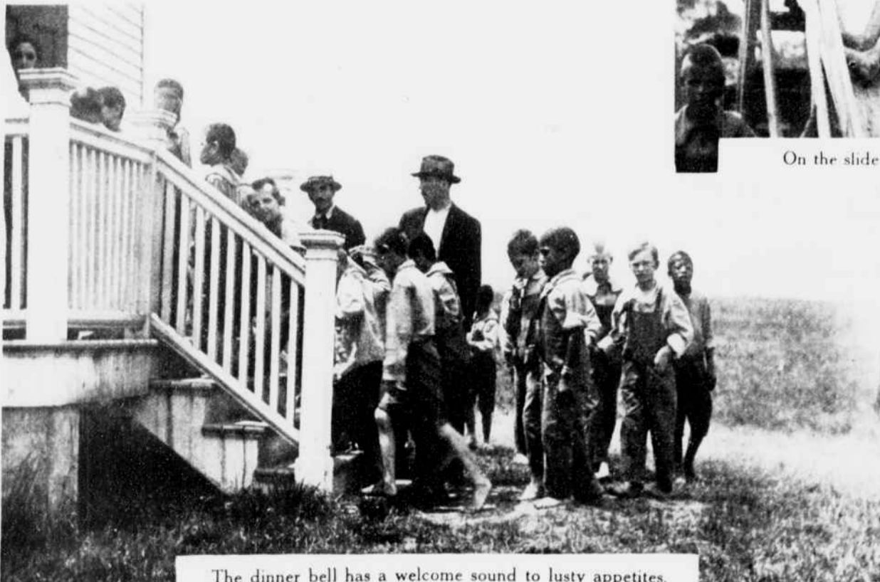
The dinner bell has a welcome sound to lusty appetites.