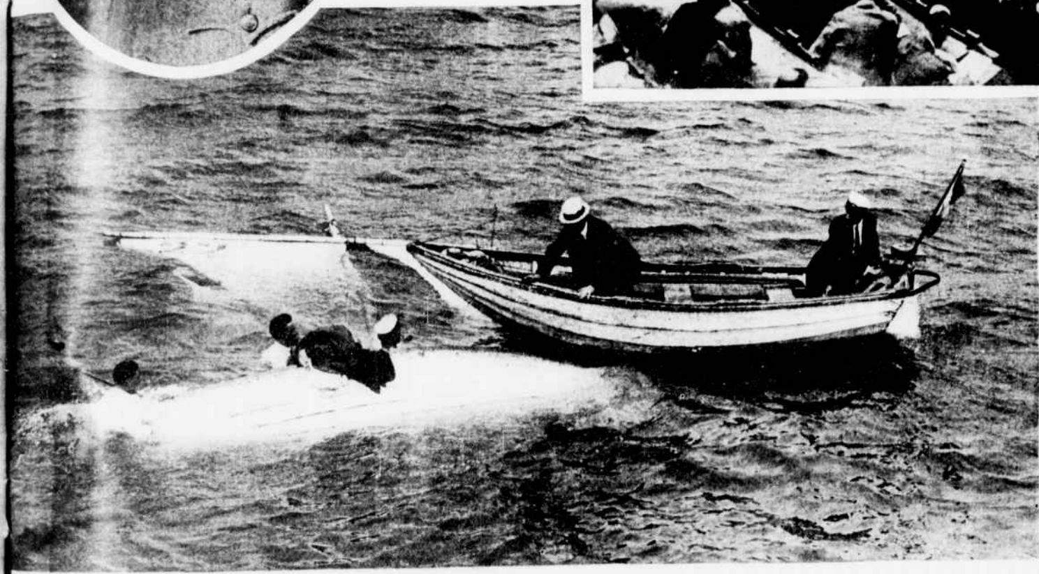
Above: At the races held by the sailor boys of Dutch freighters in the Hudson in honor of the birthday of Queen Wilhelmina of Holland. Over forty boats participated. No. 22 capsized and the occupants are being rescued by a small motor boat. Two of the crew have kept their pipes above water.