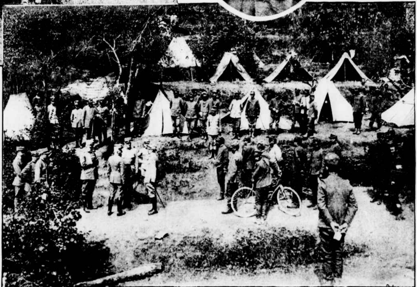
General Cadorna, chief of the Italian army visits a front line encampment. Can you pick him out?