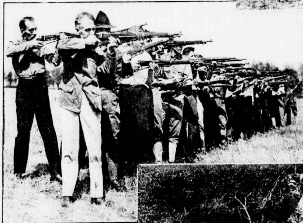
Learning to shoot. Drafted New Yorkers training daily at Governor's Island.