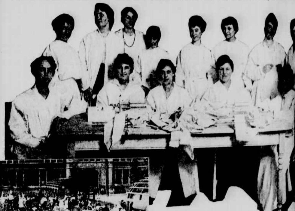
Above, girls from the Queens County Red Cross, who have volunteered to make bandages at the Y. M. C. A.