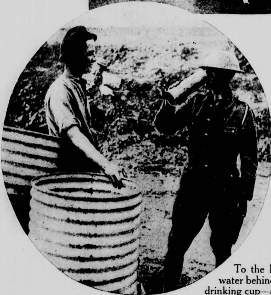
To the left, above, a drink of water behind the lines from a novel drinking cup—a discarded shell case.