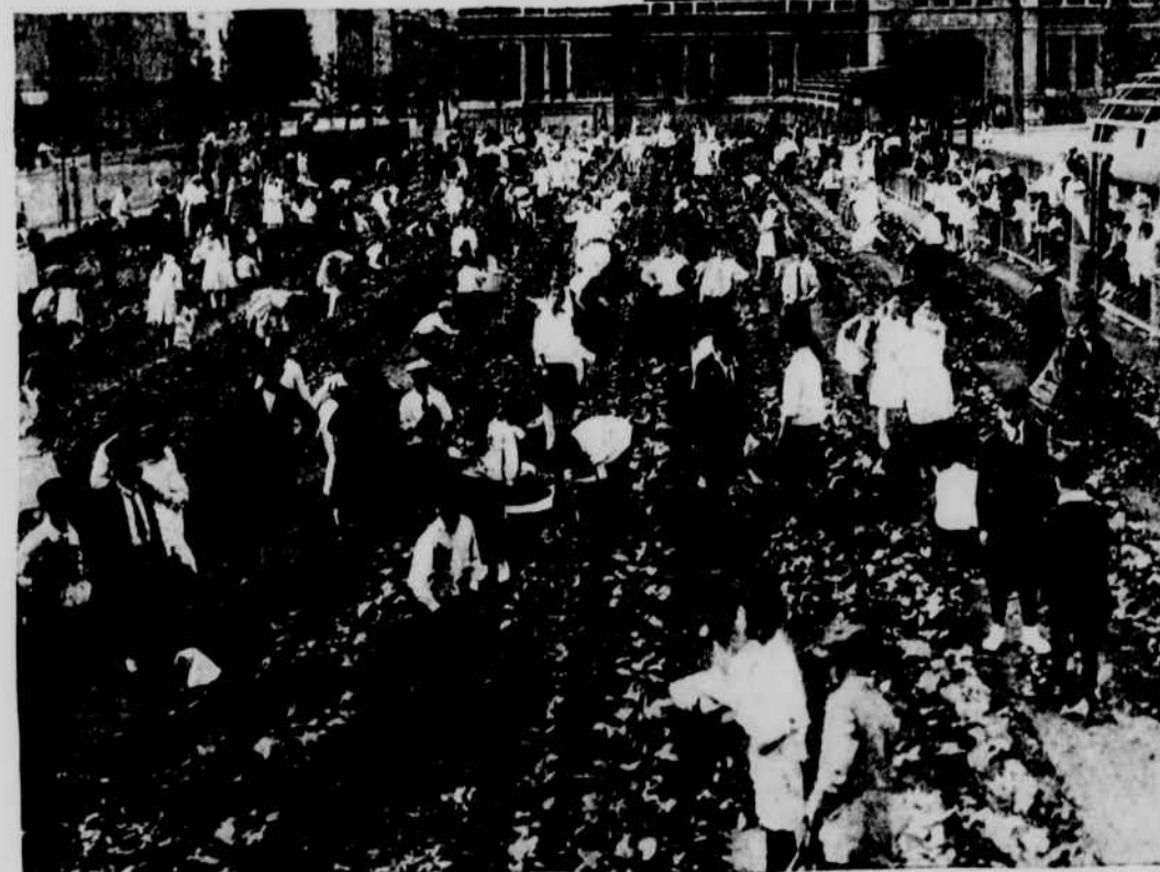
School children of Brooklyn exhibiting some of the produce raised by them at the Betsy Head Farm Gardens, at the general inspection of the city's food gardens last week.