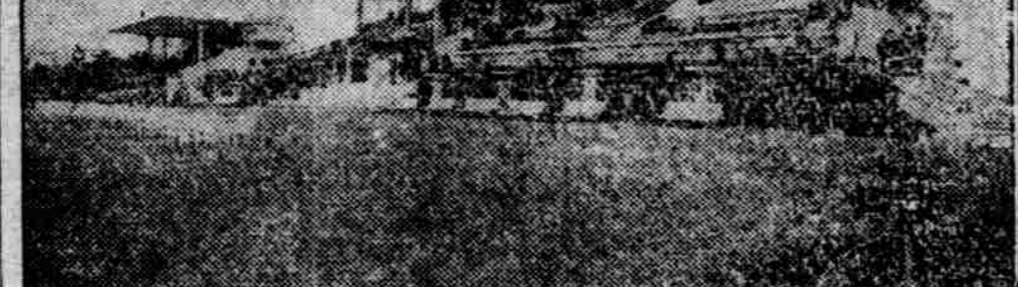
PRIVATE CONCOURSE AT BUENOS AIRES RACE TRACK—THE RACES HERE ARE ONLY RIVALLED ONLY BY THOSE OF PARIS.

A BUSINESS involving an annual outlay of over a billion dollars, which was suspended during the four years of the war, will start again on January 7 when the pleasure cruiser Ebro leaves New York for South America. Long before the war Americans had gained the reputation of being the world's greatest travelers. It is not surprising that their pent-up energies, confined during the past five years to their own country, should turn now to other fields. A striking feature of the situation compared with the pre-war period is, however, the tremendously increased interest in the West Indies and South America. Just as these southern neighbors, during the past few years, have flocked in ever-increasing numbers to the United States, whether on business or on pleasure bent, so now the average American feeling the urge to travel turns his eyes toward Buenos Ayres, whose hotels, he hears, are rivalled only by those of New York and whose race-course rivals that of Paris. While tourist travel itself has been at a standstill during the years of war the efforts of designers and builders to provide ever-increasing comforts to meet the fastidious tastes of American travelers have not halted. The new liner Ebro contains every luxury and is the last word in ship construction. Her cabins have