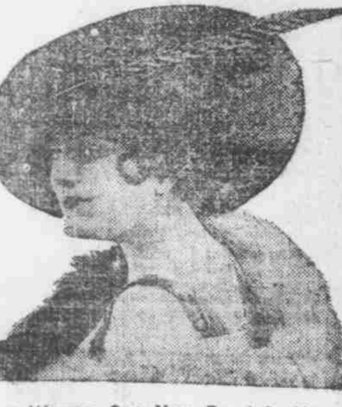
Any Woman Can Now Beautify Herself Quickly With These Formulas.