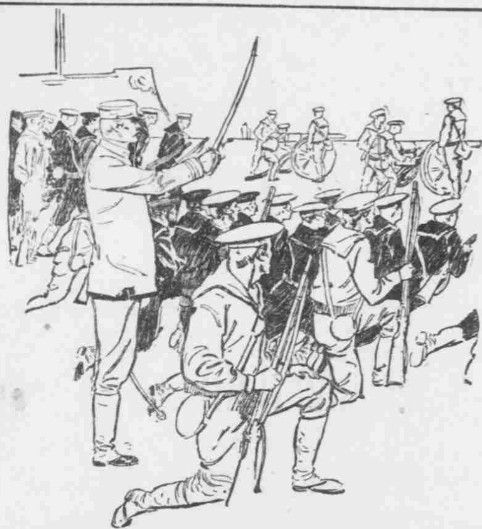
NAVY YARD RECRUITS AT DRILL. One of the features most interesting to the visitors at the Brooklyn navy yard is the drilling of recruits in the use of war weapons. Probably the most important item in this drill is the maneuvering that must be done with the six-pounder field pieces.