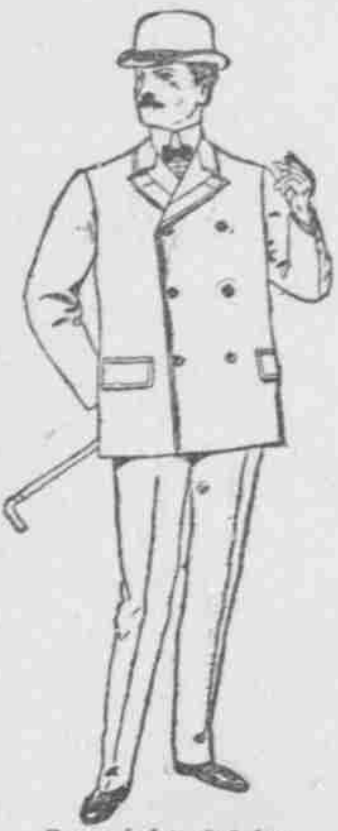
Copyright 1898 by The Stein-Bloch Co.

is certainly the most comfortable, well-looking and serviceable fabric for a man's summer suit, but it is a troublesome fabric to the tailor. It has "ravelly" tendencies which baffle the skill of any but first-class, experienced SERGE TAILORS. The serge suits in our store bearing this label, and which we sell at $16.50, are made by the most experienced Serge Tailors in America, and are so constructed that no seam can ravel or stretch, and the garment will hold its shape under all circumstances. No one can hope to possess such a suit made to measure at less than double this price.