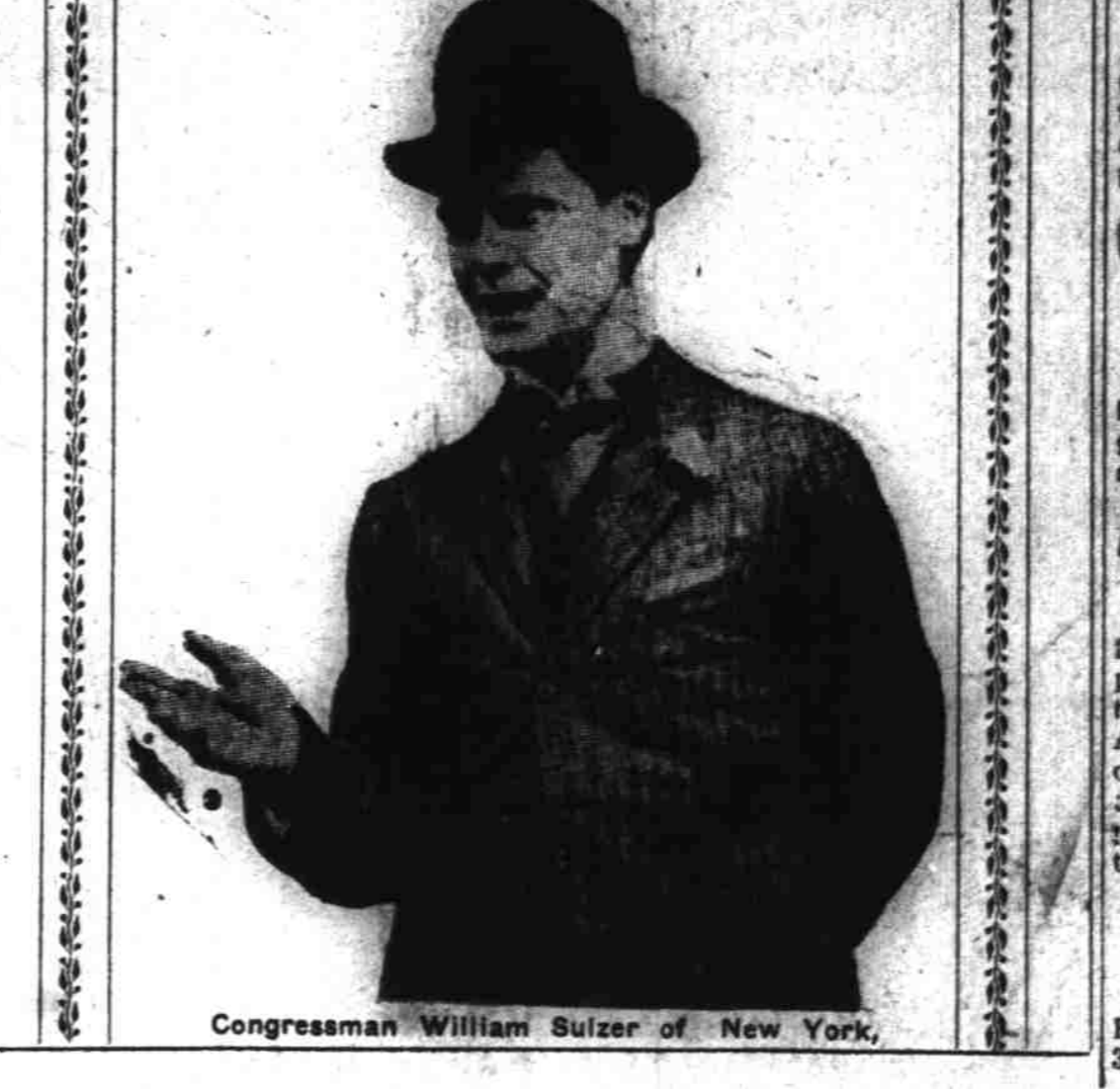
Congressman William Sulzer of New York.

(Special Star-Bulletin Cable) SAN FRANCISCO, Cal., Nov. 7.—Gov. Johnson still controls the California Legislature, the election of members showing that his wing of the party in California is in the majority.