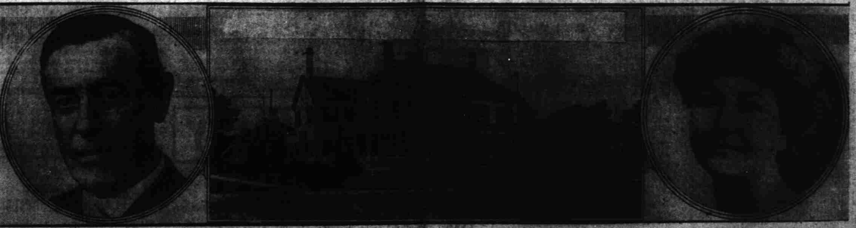
THE "LITTLE WHITE HOUSE," AT SEAGIRT WILL SOON TAKE THE PLACE OF SEVERLY, MASS., AS THE "SUMMER CAPITOL." MR. WILSON AND HIS CHARMING WIFE ARE EXPECTED TO ADD MUCH OF THEIR PERSONALITY TO THE TONE OF SOCIETY IN ADMINISTRATION CIRCLES, AND AS BOTH LIKE TO ENTERTAIN THEIR FRIENDS, SEAGIRT WILL BE A BUSY SPOT IN THE SUMMERTIME FOR THE NEXT FOUR YEARS.